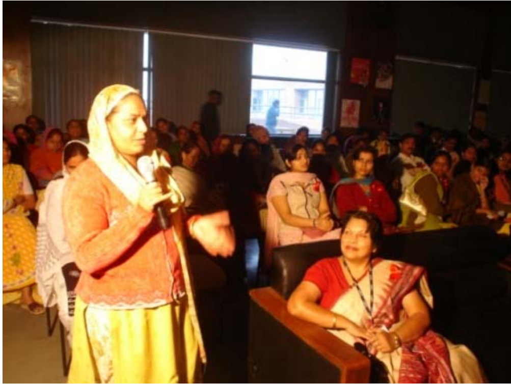
Participants interacting during the event