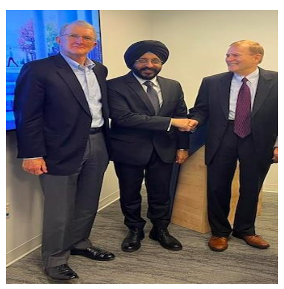
Developing partnership with the top leadership of Johns Hopkins University, USA