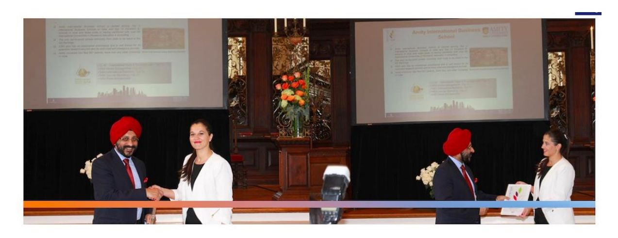
Awarded at Annual Convention of Eduniversal at Harvard University Eduniversal Top 5 Business Schools in Central Asia and Best Business School in India with 4 Palms of Excellence Best in Asia for providing Global Exposure