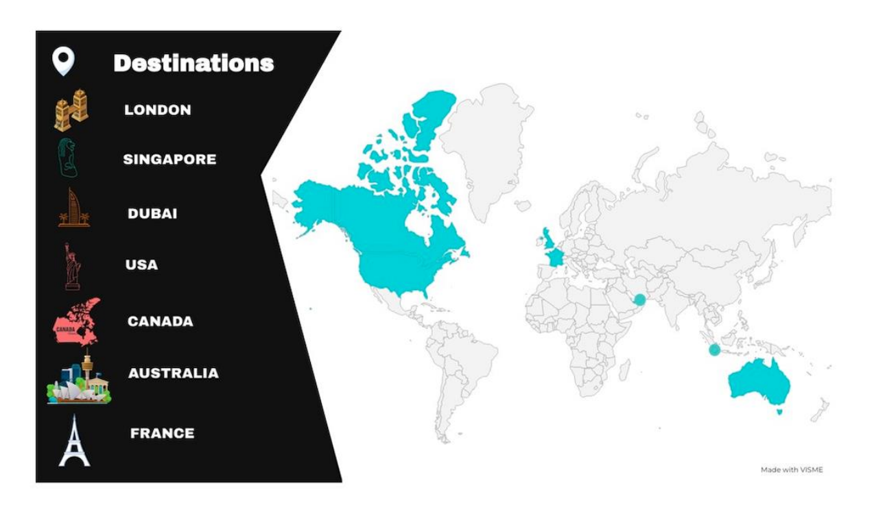
Destinations -Study Abroad Programme