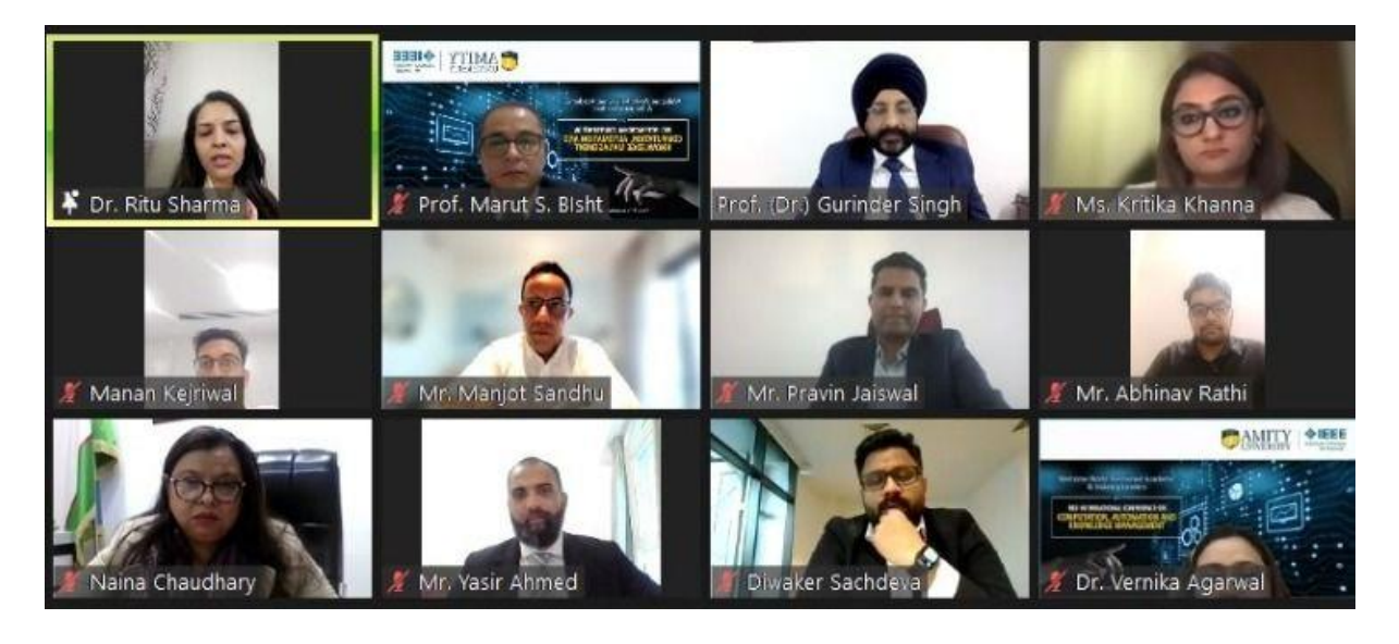
An Alumni Meet of Amity University's globally placed students organized by Amity University Tashkent in October 2022.