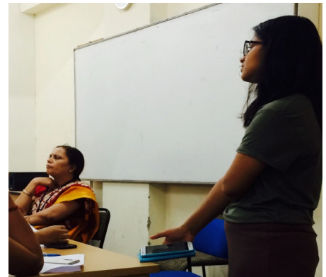
Story Telling Session in Progress

The students were inculcated with a better and more free perception of the world.