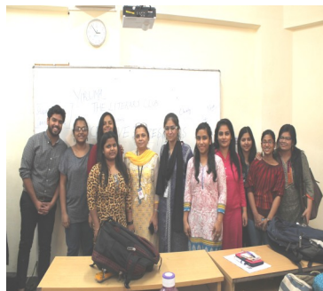
The Newsletter Team