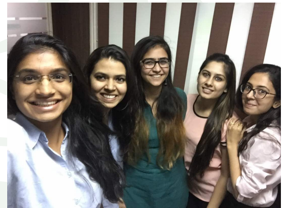
Our Students at CIPT

We congratulate the team and the respective students who have envisaged on their professional journey and wish them all the luck and growth, to achieve greater heights and carry the passion and zest of life that this institution helps them