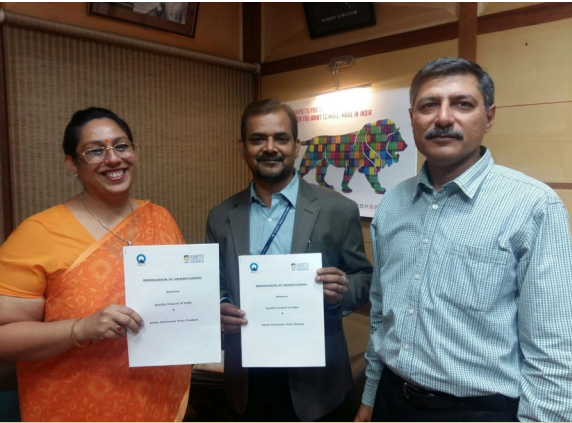
Director, ASE at signing of the MOU

On India's 68 th Independence Day, Hon'ble Prime Minister Shri Narendra Modi in his address to the Nation urged the industry, especially the Micro, Small and Medium Enterprises (MSMEs) of India to manufacture goods in the country with "zero defects" and to ensure that the goods have "zero effect" on the environment. Taking this vision of the Prime Minister into account, ZED is a marquee initiative linked to make in India championed by the Quality Council of India (QCI). To expand the reach of the ZED Program, ZED Cells are being set up at multiple avenues, like – E-commerce, OEMs, Research Centers, Universities, Industry associations and MSME Technology centres.