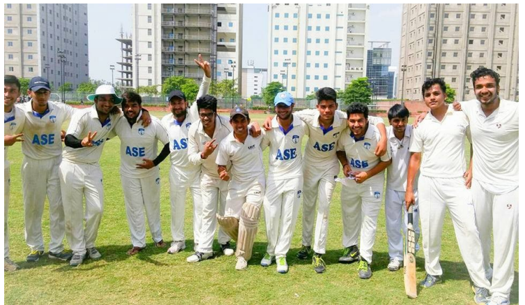
ASE Cricket Team

With players fighting hard to bring glory for their departments, semi final matches were always going to be full of nervous energy and the