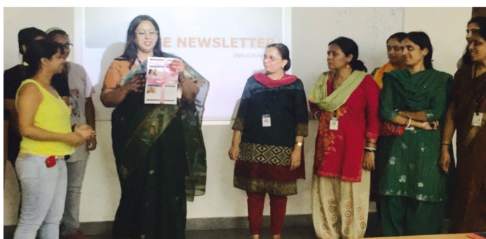
Release of ASE Newsletter

To begin with, the department released its first newsletter on the 13th of October. ASE signed a MOU with ZED cell on 10th October. We also organised our first seminar with the