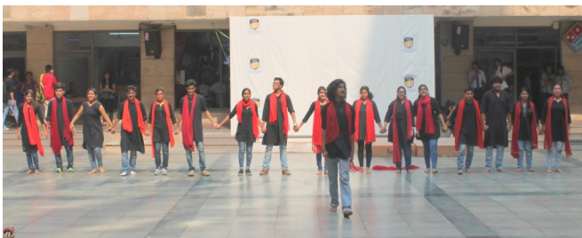
Dramity Performing Nukkad Natak at H-Block

The drama club of Amity School of Economics conducted a nukkad natak "NAARI" in H block. Dramity raised the issue of crime against women by covering each and every aspect from female infanticide, gender bias, child marriage with old and disabled people which is still prevalent in some parts of India especially the rural areas. Also they showed the increased hypocrisy of the Indian society by showing how parents take money from govt in the name of various schemes launched by the govt but actually don't utilize it for the welfare of their daughters. The nukkad natak further created awareness about the narrow minded and conservative mindsets of the people. The falseness of the political leaders was also portrayed well by showing the bleak promises made by them before election and the reaction of the leaders to the crimes against women where the blame goes to the girl for getting harmed. The increased hunger of the male dominated society for committing crime against women was shown by the students acting like a hungry pack of wolves ready to prey.