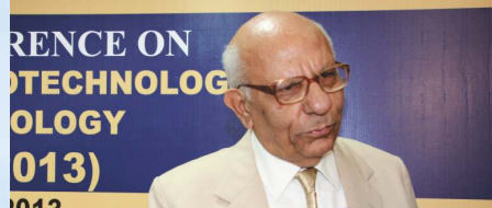
National Conference on "Recent Advances in Biotechnology and Nanobiotechnology"