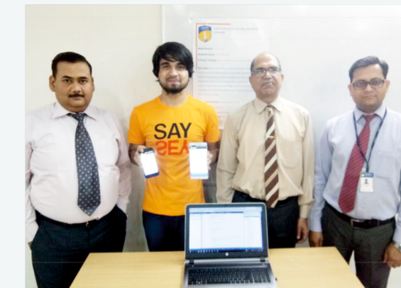
100 Dial app for State Government

Amity University Gwalior students thrive in a vibrant culture of innovation and new ideas.