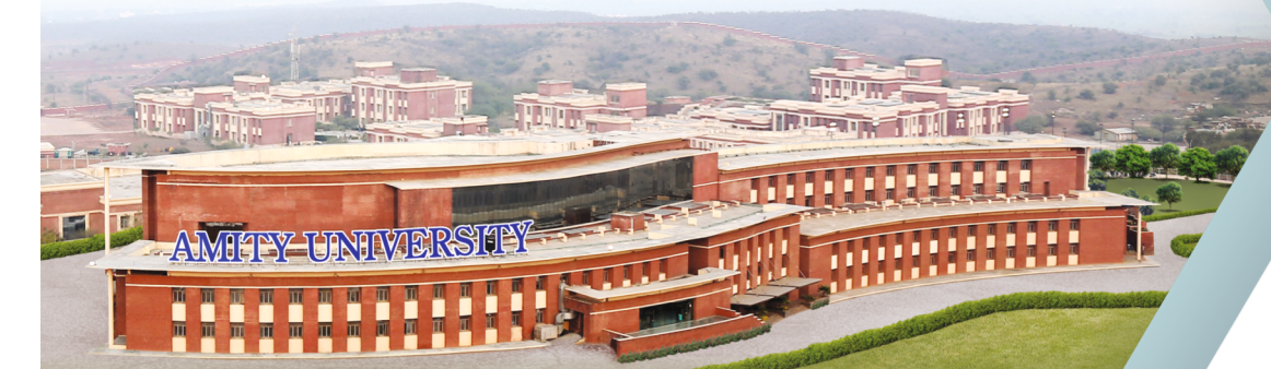
100 ACRE WORLD-CLASS AMITY UNIVERSITY GWALIOR CAMPUS