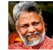
Dr. Rajendra Singh Waterman of India Indian environmentalist