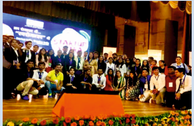
Start-Up Yatra by Amity Entrepreneurship Cell to motivate students to take up entrepreneurship as a career option, to generate more university spin-off companies based on academic research in collaboration with incubators, accelerators, angel investors, venture capitalists and banks