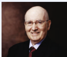
Dr. Philip Kotler, Marketing Management Guru