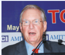
Mr. Tom Peters, Management and Innovation Guru

Students of Amity Business School are groomed to become industry-ready professionals through regular interactions with the leaders of the corporate and the academic world.