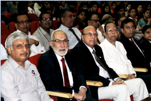
A Panel Discussion on Goods and Services Tax was organized at Amity Business School, Lucknow Campus. Various aspects related to implementation of Goods and Services Tax Act was discussed by the esteemed panel members.