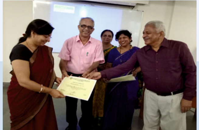
A workshop on business research using SPSS was conducted to familiarize the participants about the various quantitative techniques and enable them to analyse and interpret data using SPSS software.