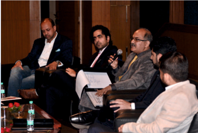
Eminent speakers in CEO Meet shared insights on challenges and issues in managing businesses risks, fostering change, making decision, planning forward and solving problems.