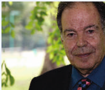
Dr. Edward De Bono, Lateral Thinking Guru