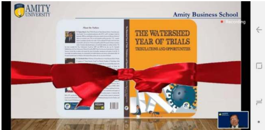
Launch of Book