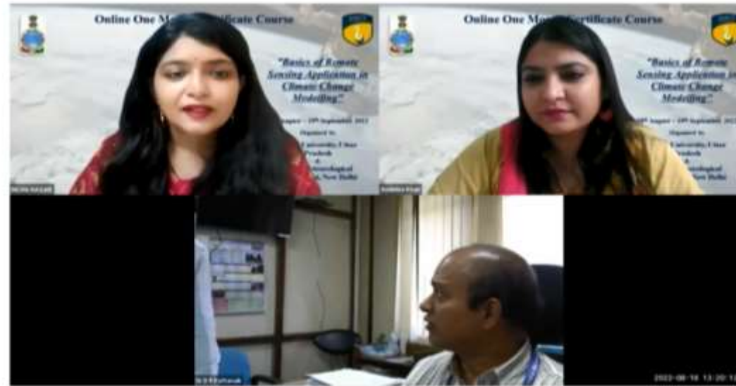
Online One Month Certificate Course on Basics of Remote Sensing Application in Climate | 18th Aug 22