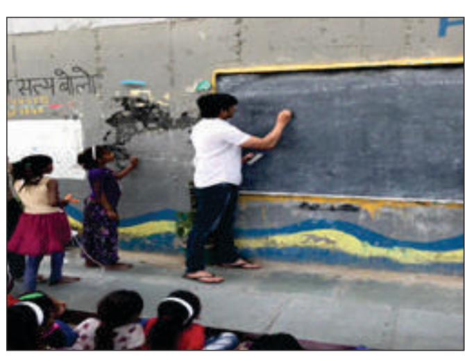
Teaching at slums