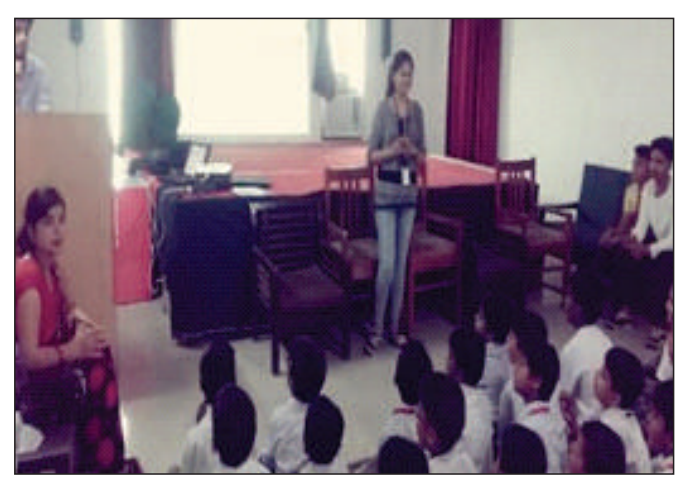
Awareness program on social issues