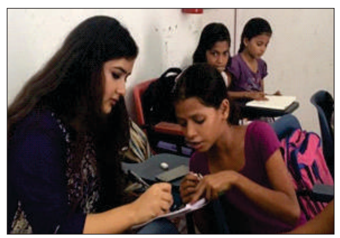
Education for underprivileged