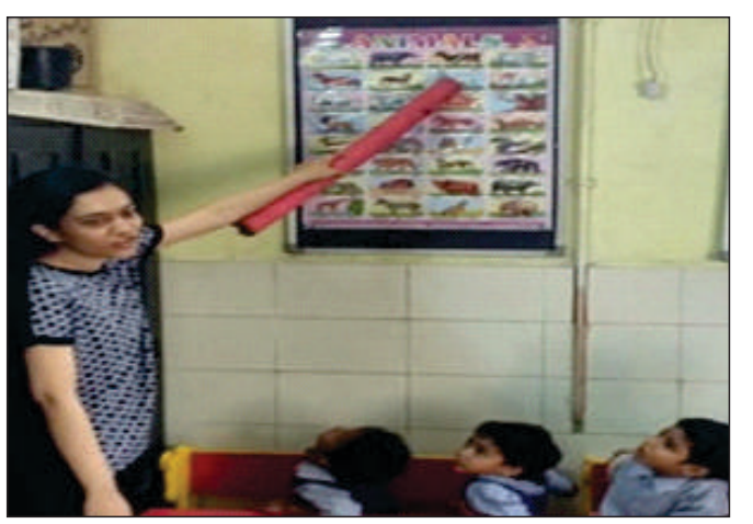
Worksheet activities with children