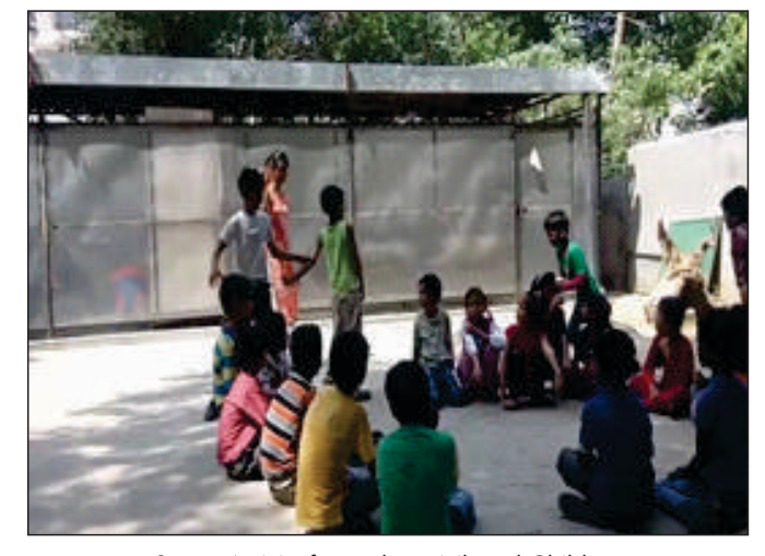
Sports Activity for under privileged Children