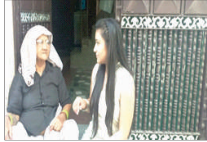
Educating women against domestic violence and elderly care