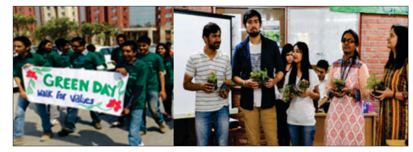
Students engaged in Environment Awareness and Tree Plantation related Activities