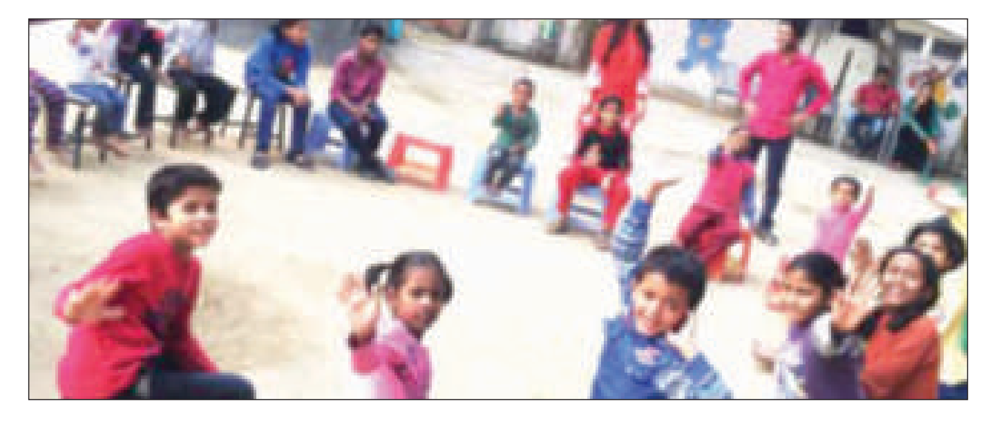
Activities related to Extra-curricular for children from slums