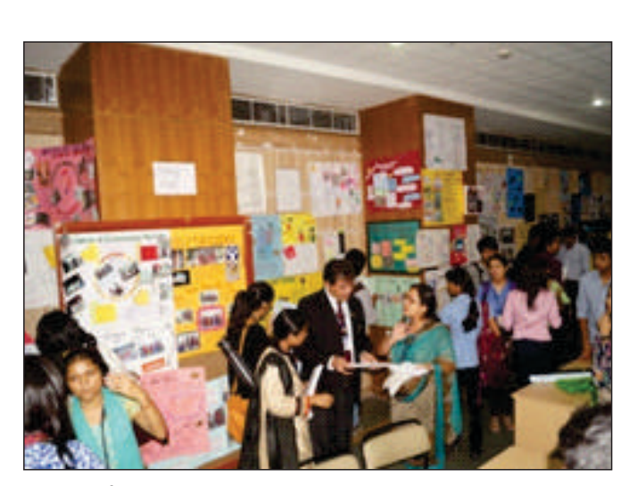
Hon'ble Vice Chancellor Madam reviewing the Poster Presentation of HVCO/CO