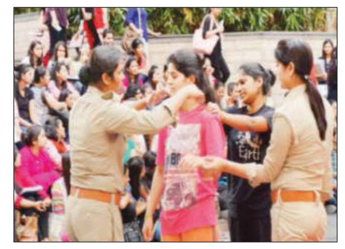
Training on self-protection