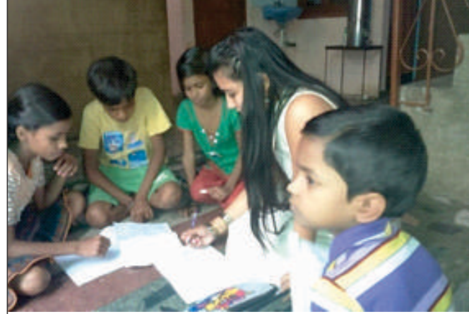
Teaching learning activities with children