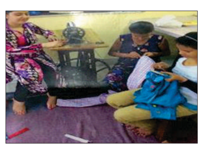
Students engaged in livelihood related Activities