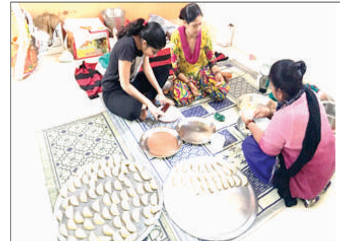
Enhancing skills for livelihood