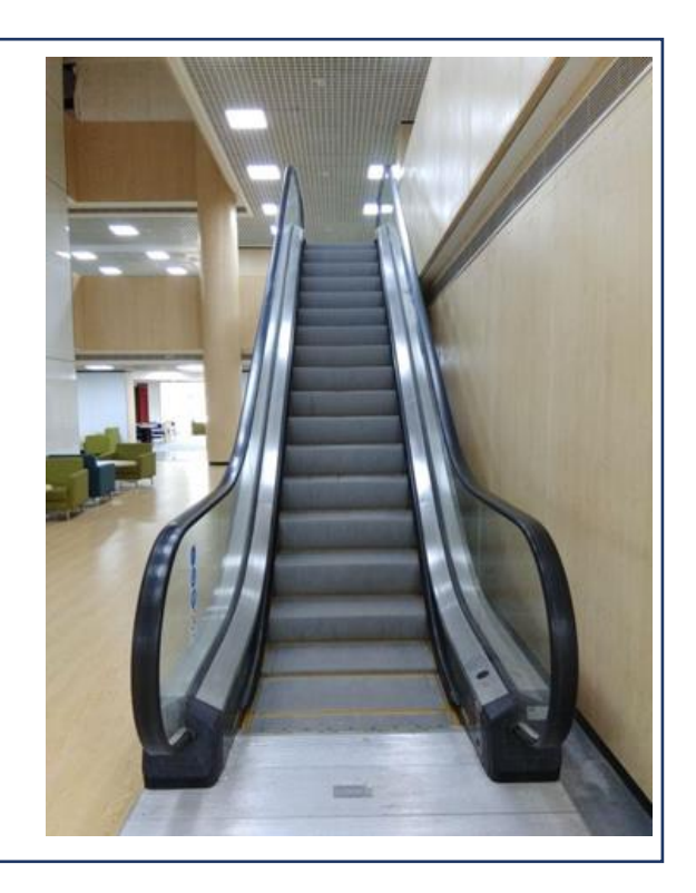
FIG: PROVISION OF LIFT AND ELEVATORS