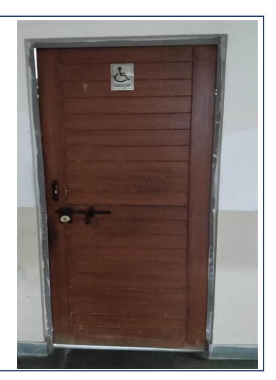
FIG: DIVYANG FRIENDLY TOILETS