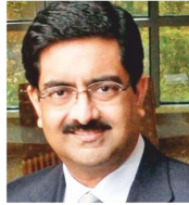
Kumar Mangalam Birla Chairman, Aditya Birla Group