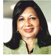
Kiran Majumdar Shaw Chairman and Managing Director, Biocon Limited