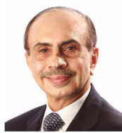
Adi Godrej Chairman, Godrej Group