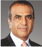
Sunil Bharti Mittal Chairman, Bharti Airtel