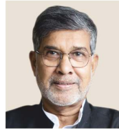
Kailash Satyarthi Social Reformer and Founder, Kailash Satyarthi Children's Foundation