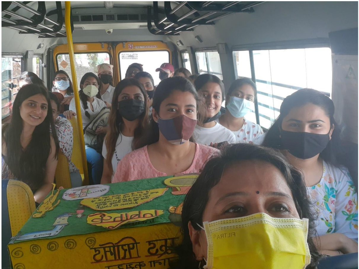
AUH Team of students and Faculty member during their journey to the venue.