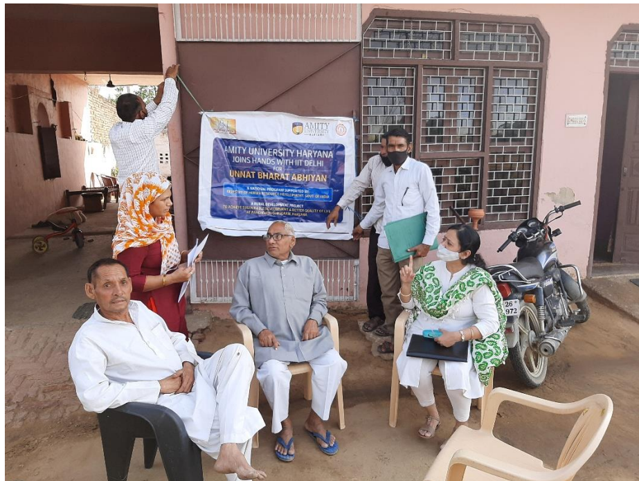
Meeting with Family members of Numberdar of Chandla Dungerwas