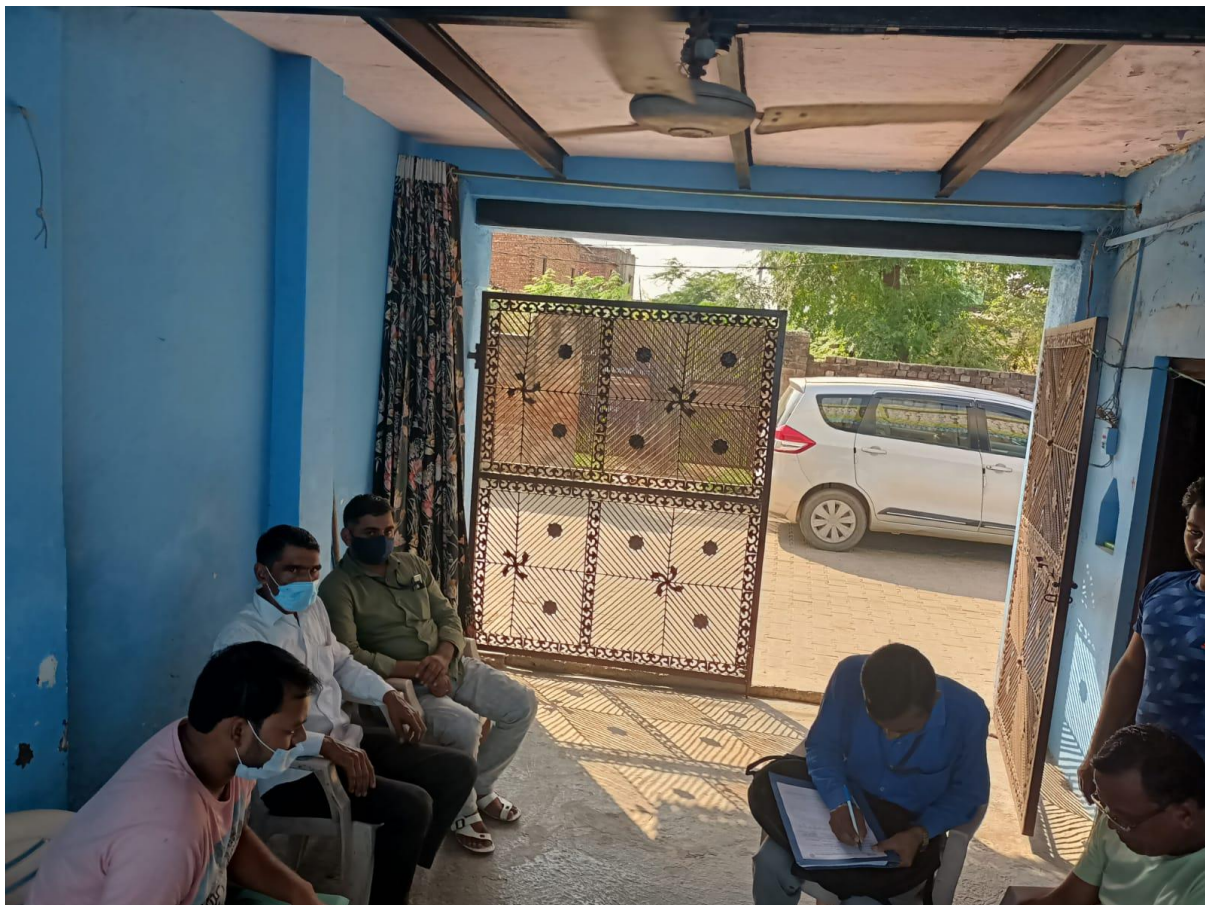
Interaction of AUH staff with Villagers