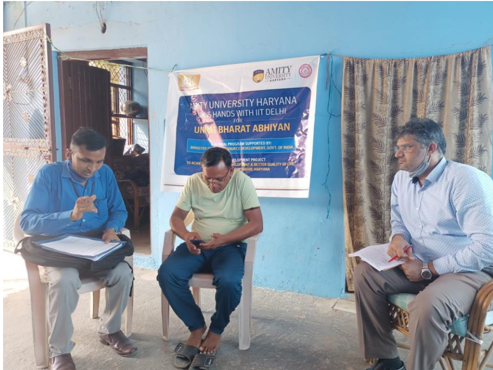
Meeting with Sarpanch of Fazalwas