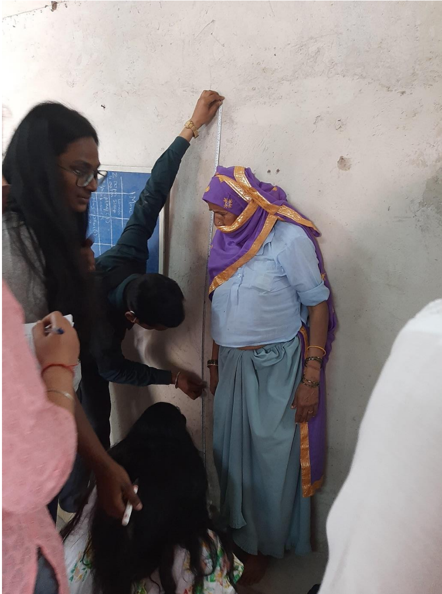
BMI Calculation Activity by students