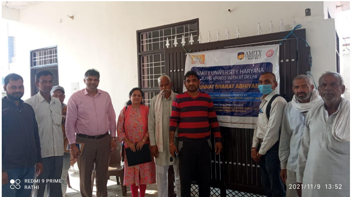
Meeting with Sarpanch and members of Panchayat of village Fakarpur