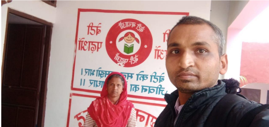
Interaction of AUH staff with Villagers