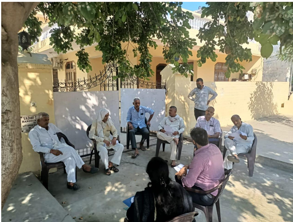
Meeting with Members of Panchayat