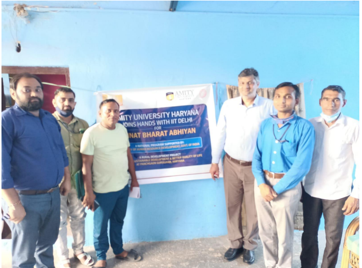
Meeting with Sarpanch of Fazalwas

Support from Anganbaari members in joining hands with Amity University Haryana for conducting development activities in the village.