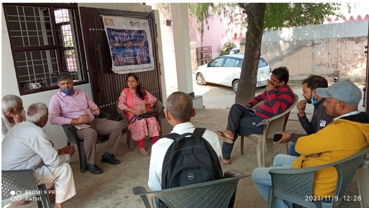
Members of Team UBA conducting the meeting