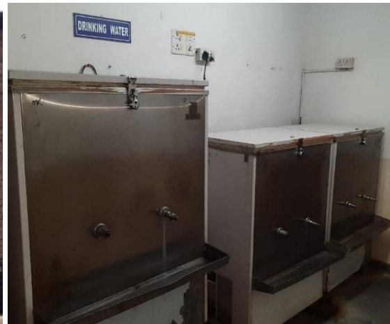
Drinking Water Facility