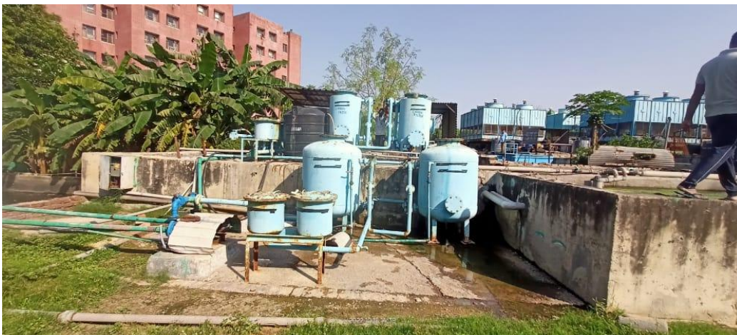
STP Plant at Amity University Haryana