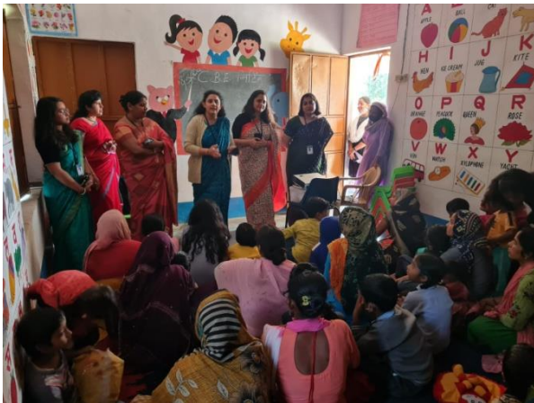
Faculties and students from ASAP Department with Anganwadi