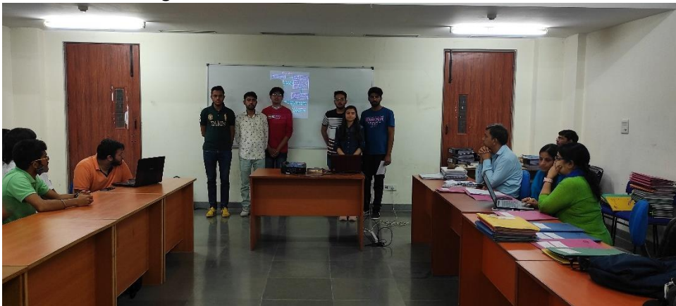
Students Presenting ideas

3.8 Photographs with caption (also share high resolution JPEG files of photographs)