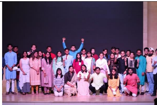
Participants, Volunteers and Organising team members showing their enthusiasm.