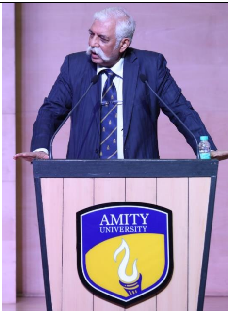
Guest of Honour Maj Gen GD Bakshi addressing the gathering