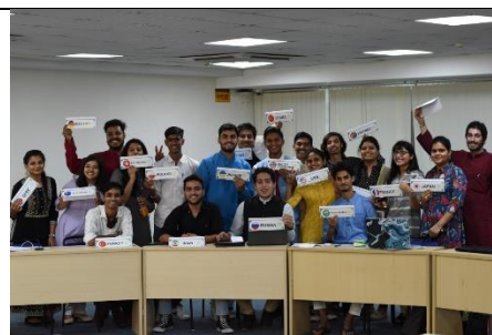
Delegates of UNGA committee showcasing their placards.