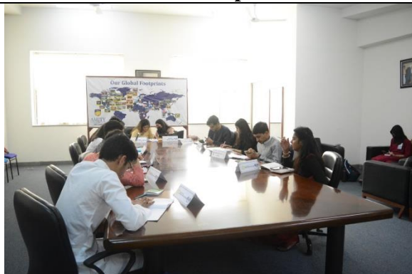
Union Cabinet Meet Committee