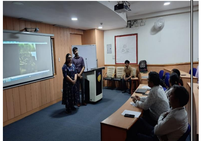
Judges checking Videos and Posters/Illustrations