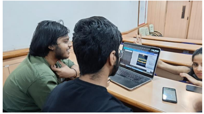
Teams using different tools/software for video editing and poster making