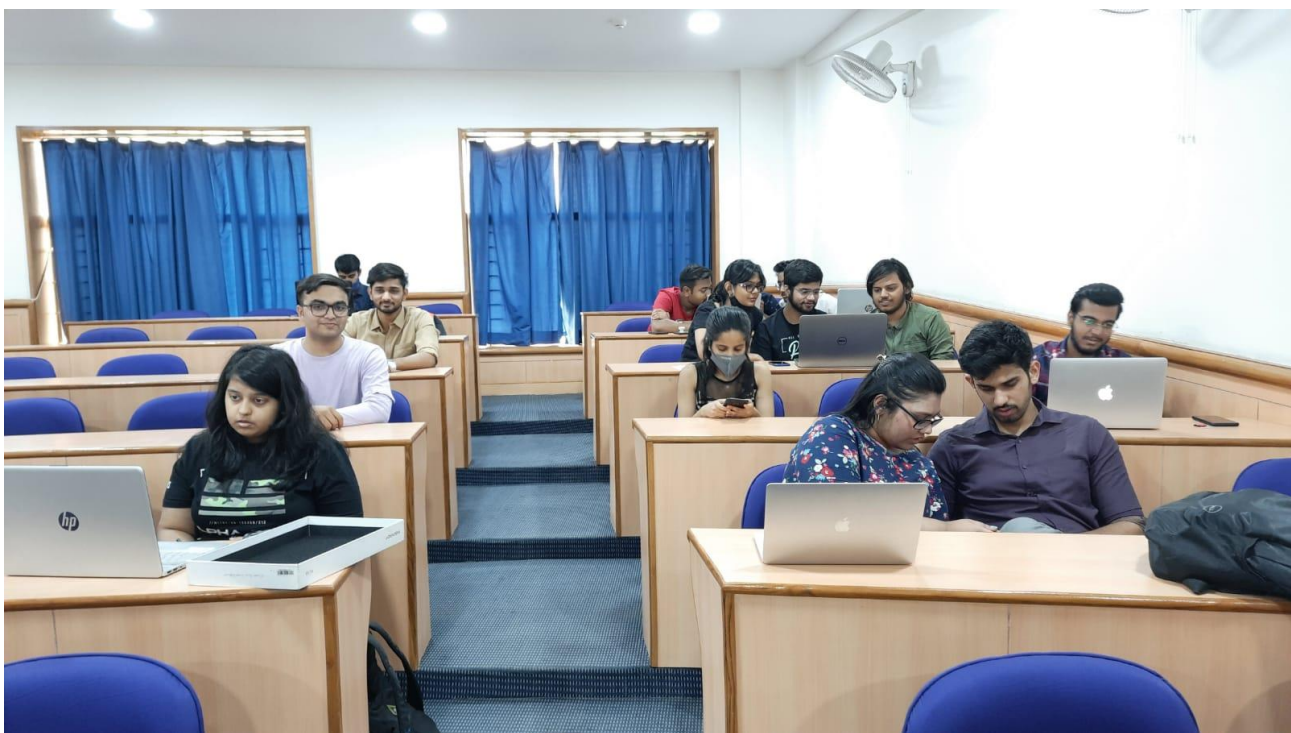
Participants working on their videos, posters and illustrations.