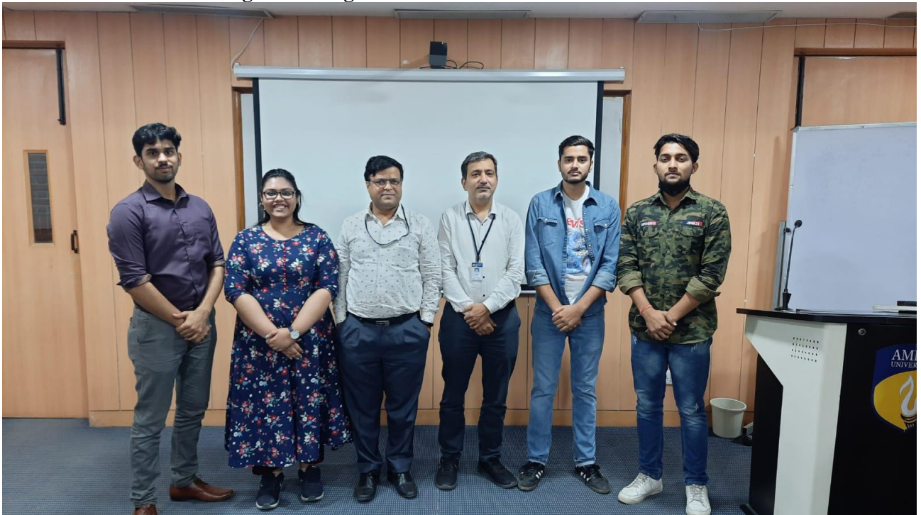
Winning teams announced by Judges