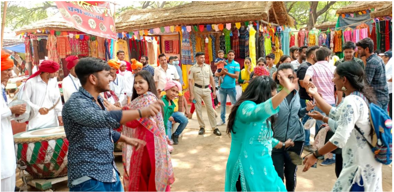
Students dancing and singing with the traditional performers at the Surajkund Crafts Fair