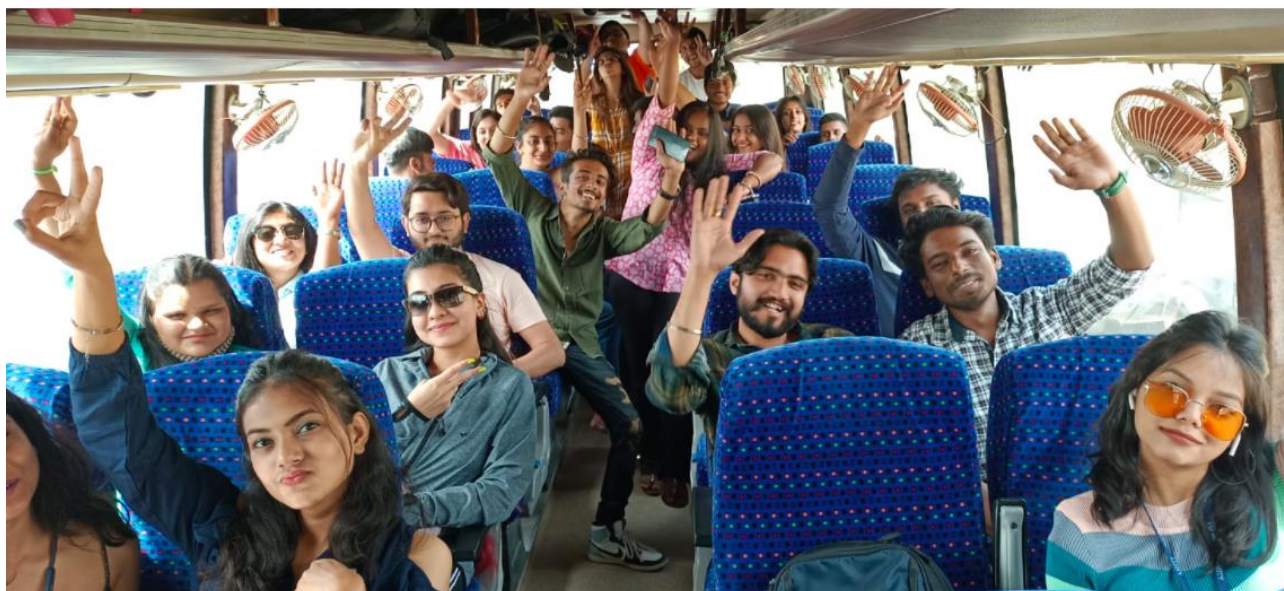
Students commuted from AUH to Surajkund Crafts Fair in the transportation provided by the university