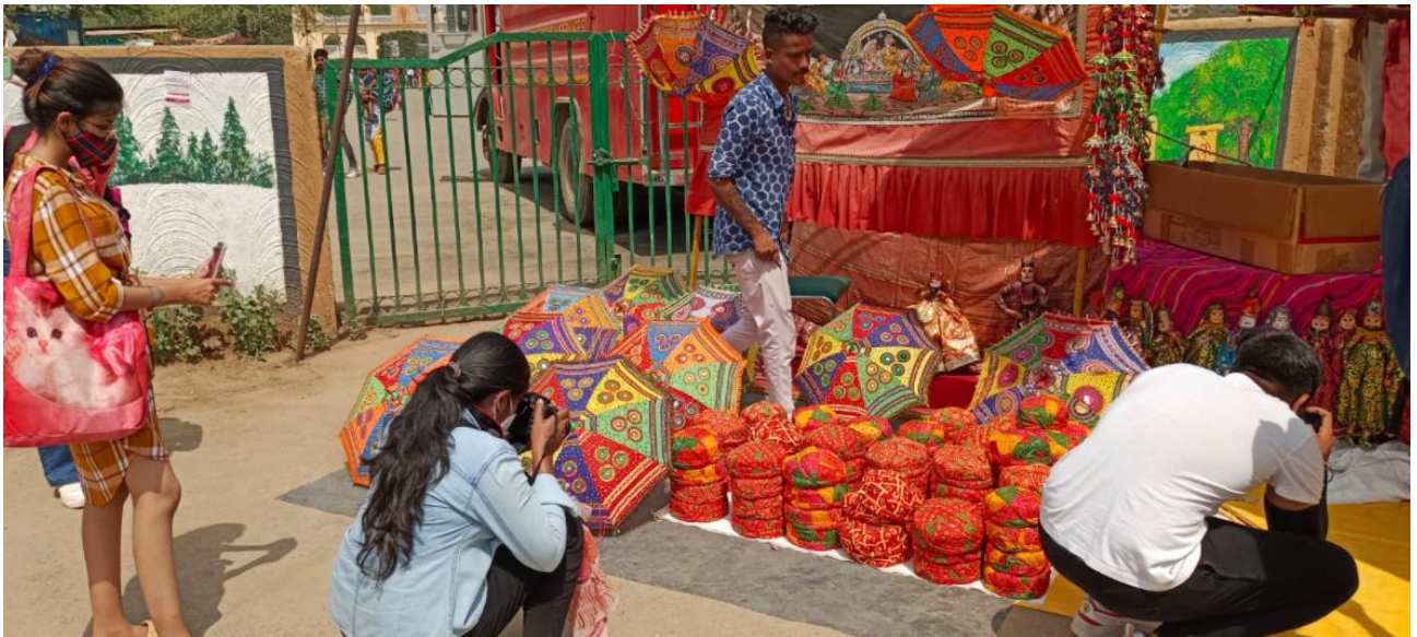
Students practicing photography and video-production at Surajkund Crafts Fair – a field trip organized by ASCO, AUH on 31/3/2022