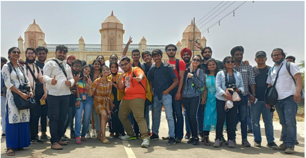
Students and faculty at the entry gate of Surajkund Crafts Fair