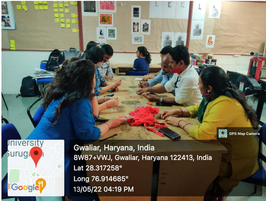
Facelifts involving in workshop