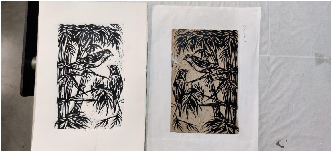
Final output of prints