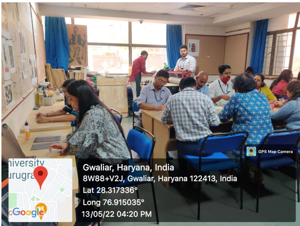
Faculties and students involving in workshop