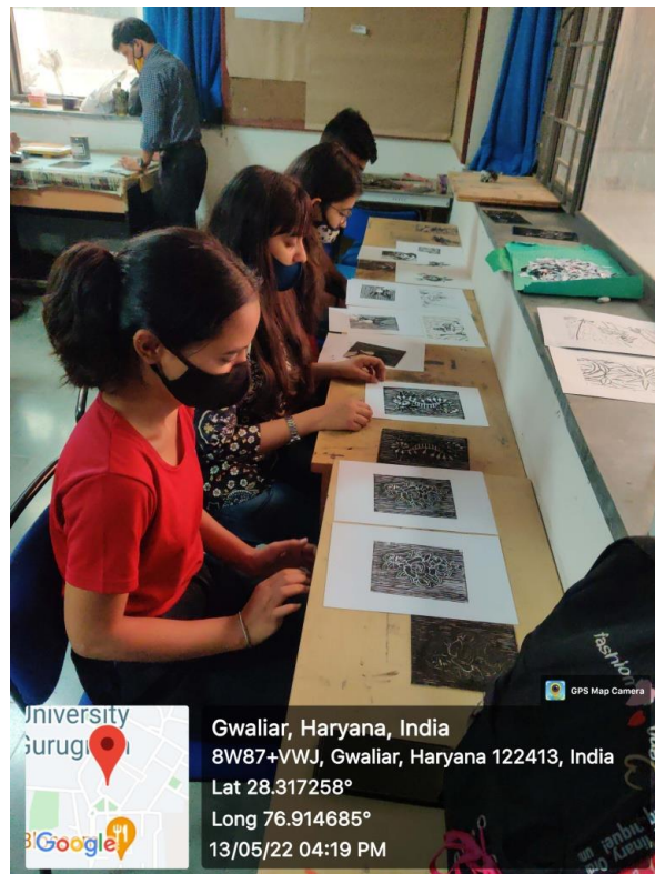
Students involving in workshop