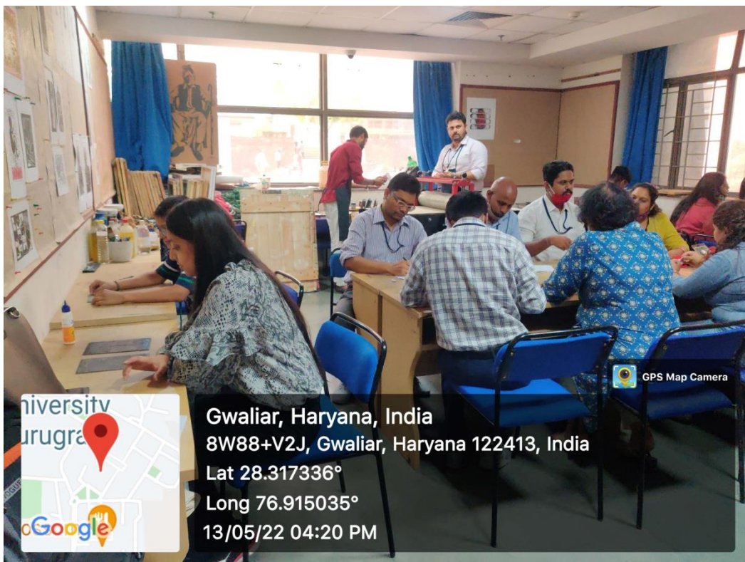
Faculties and students involving in workshop