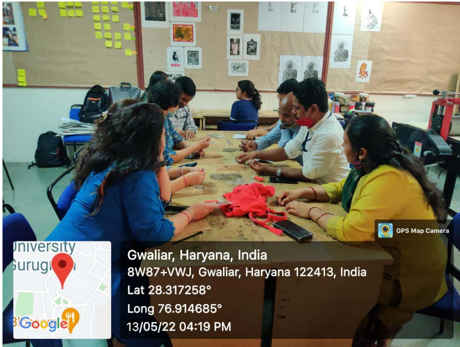
Facelifts involving in workshop