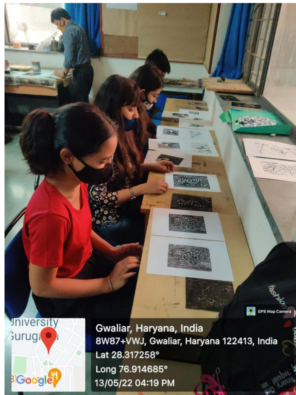
Students involving in workshop