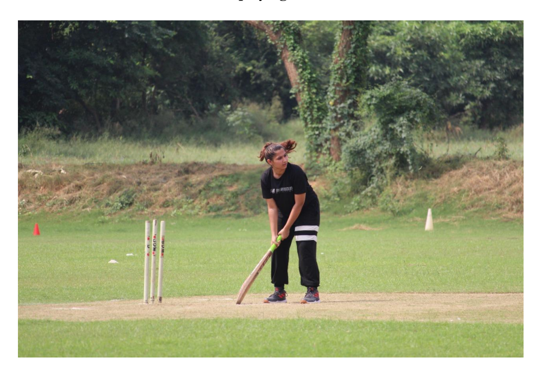
Female student playing cricket at AUH