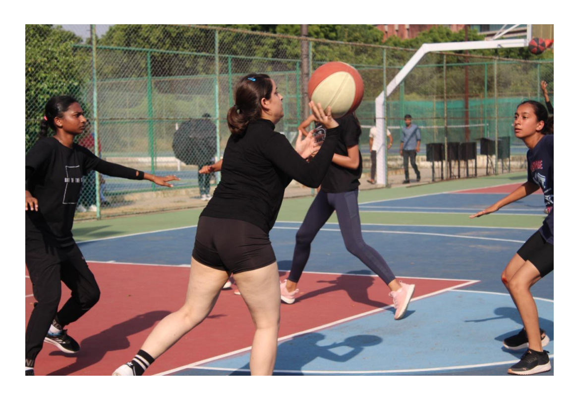
Female students playing basketball at AUH