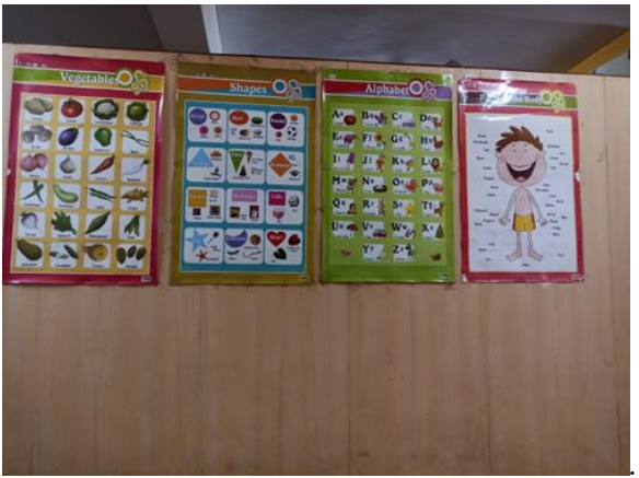
Photographs of Creche facility at AUH