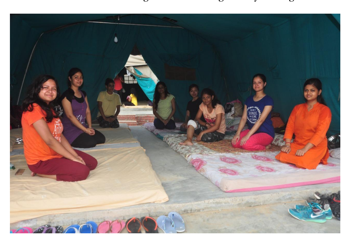
Female student in camps during military training