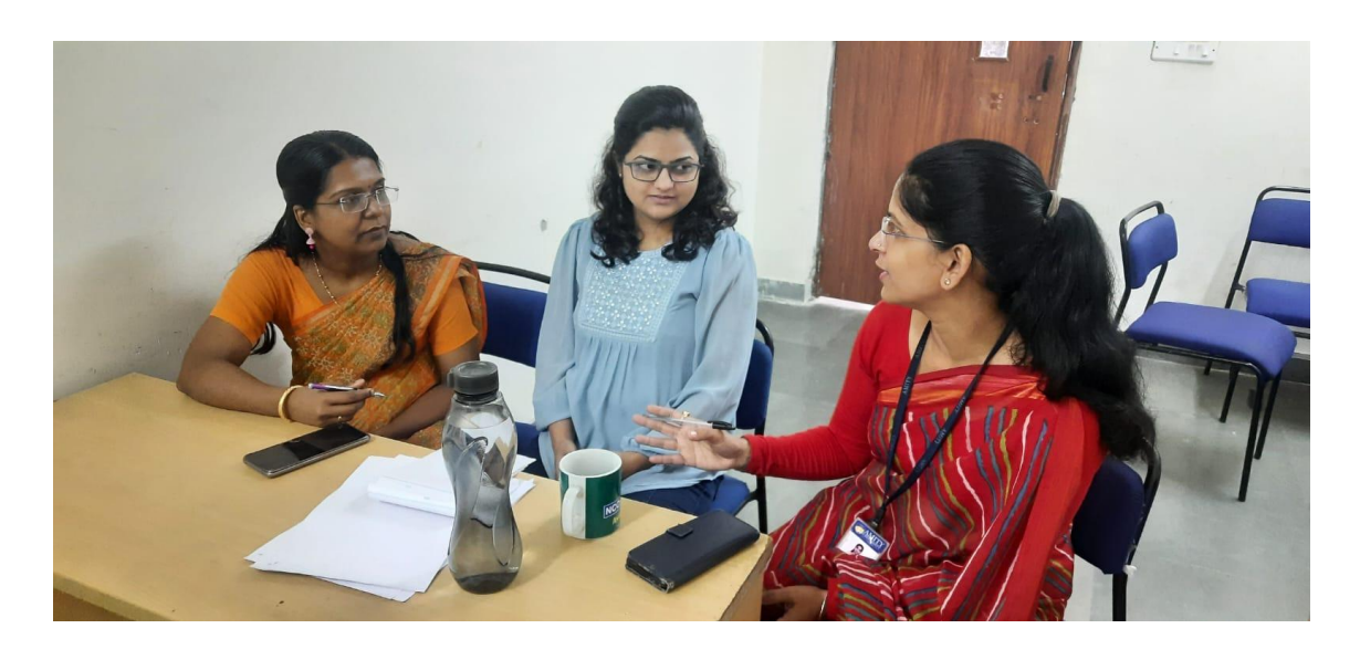
Female student during counseling session at Women's cell

Members of women cell could also be contacted to lodge a complaint. The women's cell help desk is envisaged to act as a link between the sufferer (women faculty, staff, and students) and redressal authority of University or local administration (police/ bureaucrats). It also promotes women synergy to create & enable the environment conducive to social change. AUH is strictly against any form of harassment specifically sexual harassment in the campus area. The policy for prevention of sexual harassment is in place and fully functional. There is a grievance redressal mechanism for all the students and staff. The protection of the person undergone sexual harassment is also meticulously followed. So far the university has not recorded any incidence of sexual harassment.