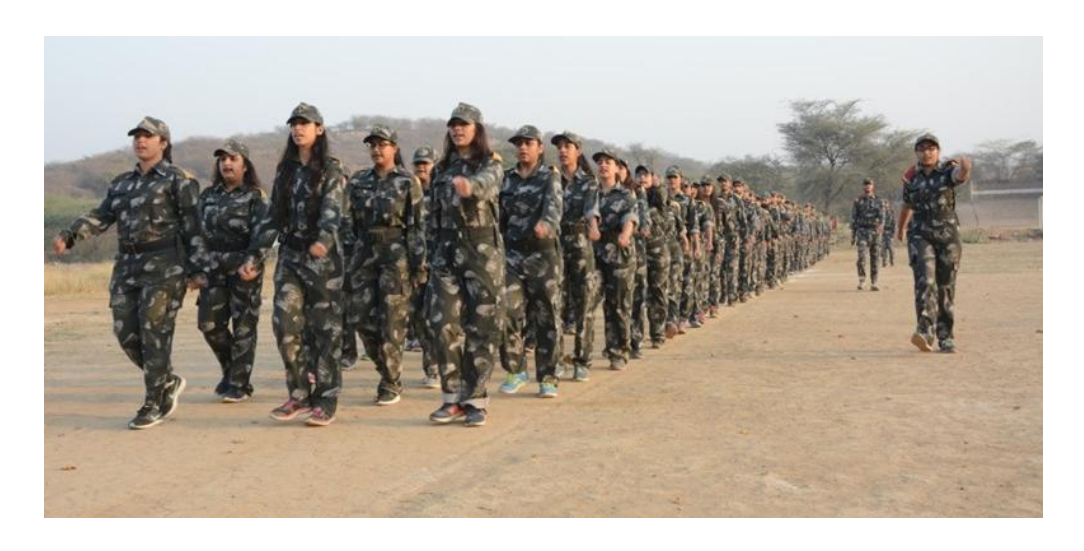
Female student doing March Past during military training

All the female students undergo 7-days military cum leadership training camp held at AUH. Students are trained by veterans of the armed forces in self-defense techniques and are also instilled with a sense of patriotism. This training empowers the young women students of the university that instills them with confidence and trust. In this way they not only get a taste of military but also turn out to be a confident and empowered individual who is ready to face the world.