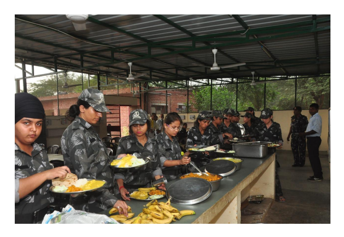
Female student taking their meal during military training