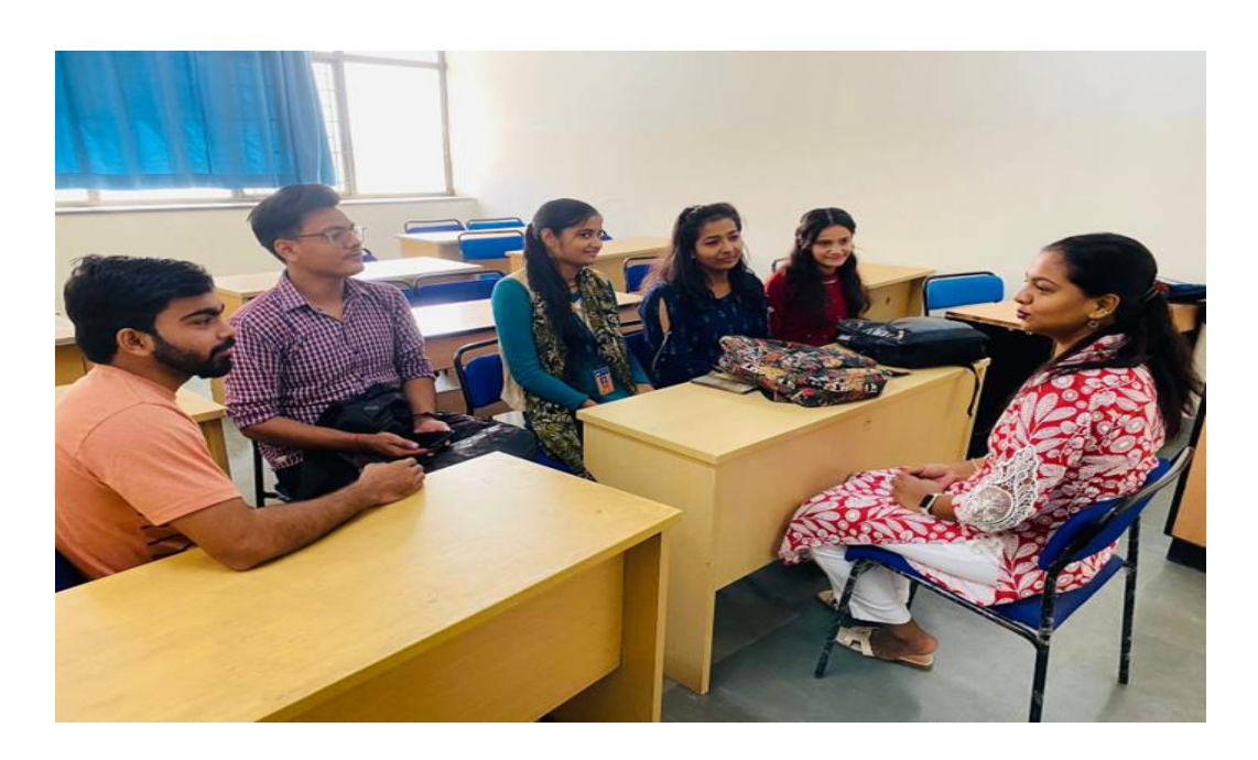
Mentor mentee session going on at AUH