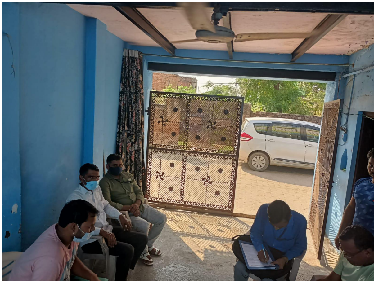
Interaction of AUH staff with Villagers