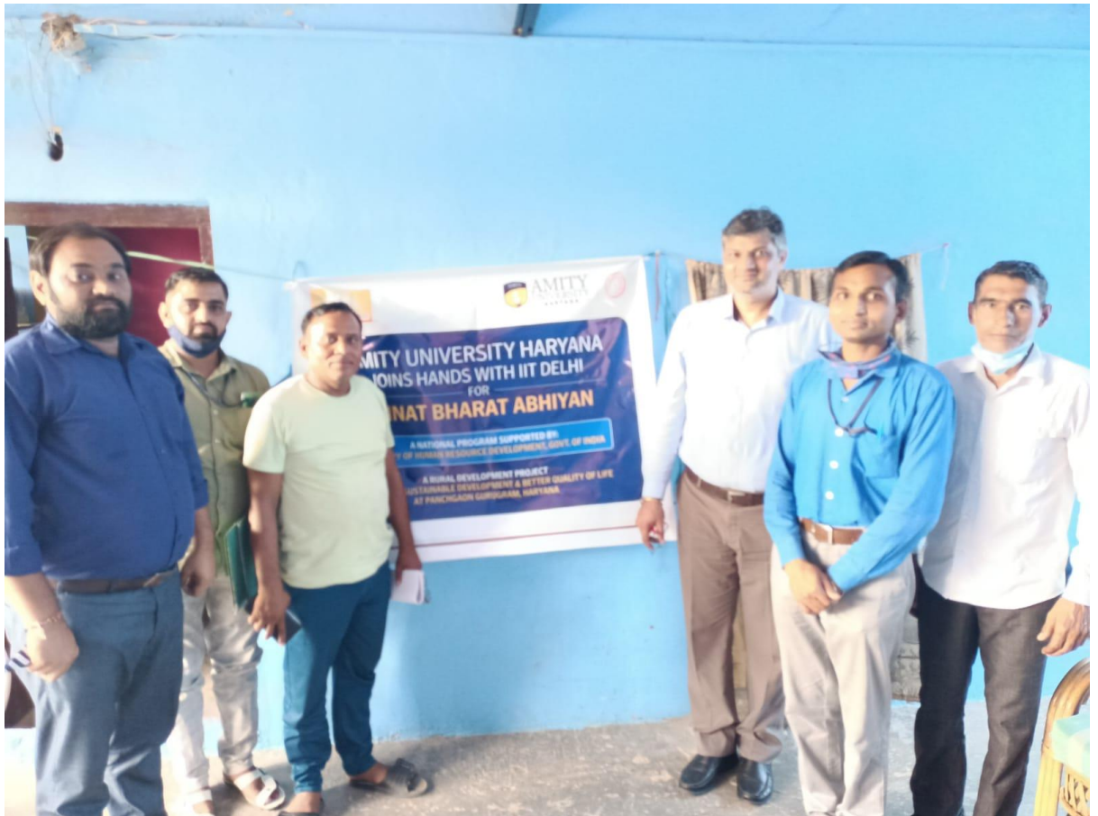
Meeting with Sarpanch of Fazalwas

Support from Anganbaari members in joining hands with Amity University Haryana for conducting development activities in the village.