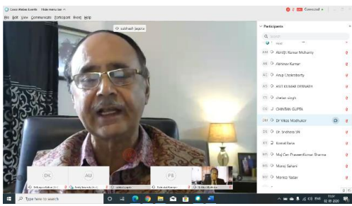
Entrepreneurship awareness during Orientation 2021: entrepreneurship drive at Amity University – Gurugram held during orientation for new batch with motive