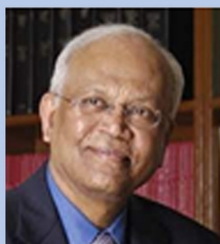
Dr. R. A. Mashelkar, Padma Vibhushan Awardee, Eminent Scientist & Former Director General, CSIR