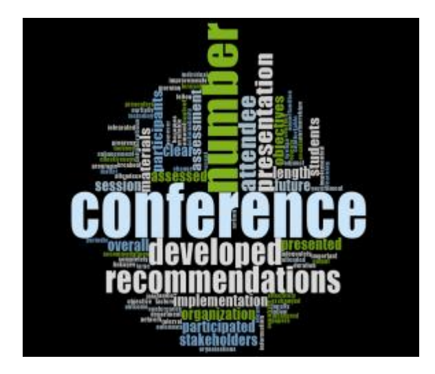
Figure 3: Responses received from focused interview from the officials of funding agency shown in word cloud.

Figures 1, 2 and 3 indicates the standard words related to the factors affecting the outcomes of the conferences. These words are in the middle, surrounded by the other preferential words associated with the outcome of the conferences suggested by respondents such participants, as stakeholders, presentation, networking, research papers, feedback system, knowledge, collaboration, recommendation, learning, platform, seminar, ideas, etc.