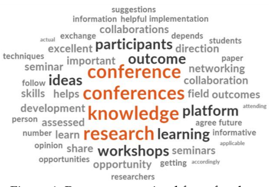
Figure 1: Responses received from faculty shown in word cloud