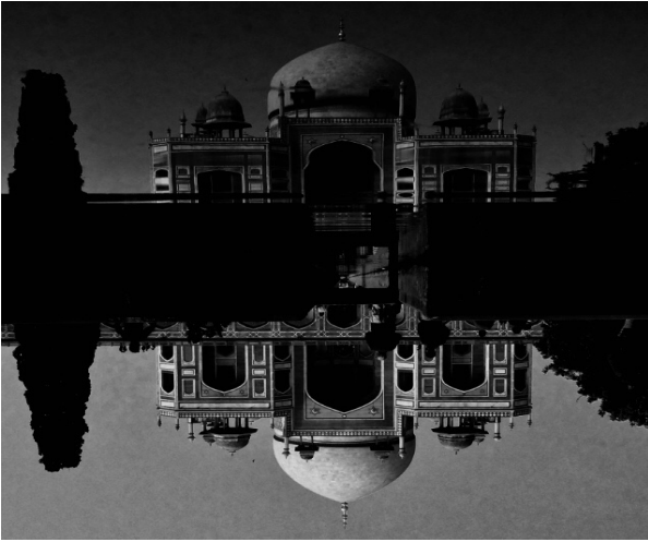
Figure-5: Taj Mahal f/2.2, ISO: 28, focal length:35 mm, max aperture2.4