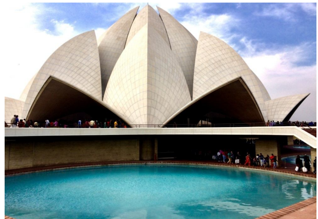
Figure-3: Lotus Temple