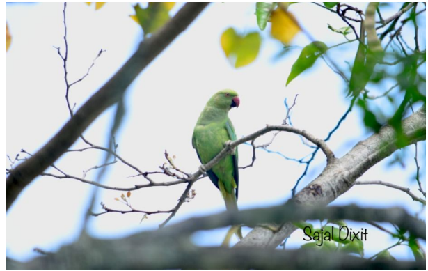
Figure-2: Parrot in its natural habitat