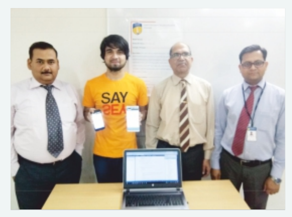
100 Dial app for State Government

Amity University Gwalior students thrive in a vibrant culture of innovation and new ideas.