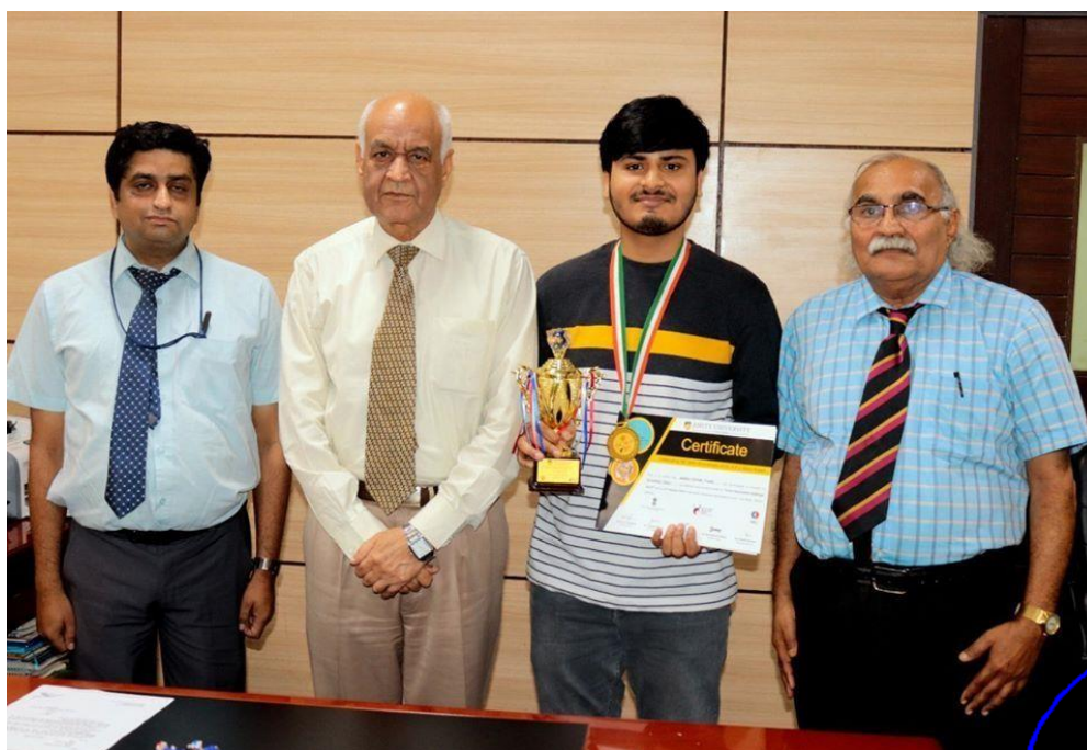
Honorable Vice chancellor AUMP with Director AIP, Faculty coordinator and Winner