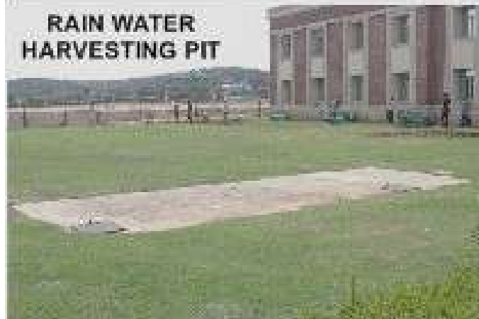
RAIN WATER HARVESTING PIT

Appreciated by Hon'ble Highcourt Gwalior