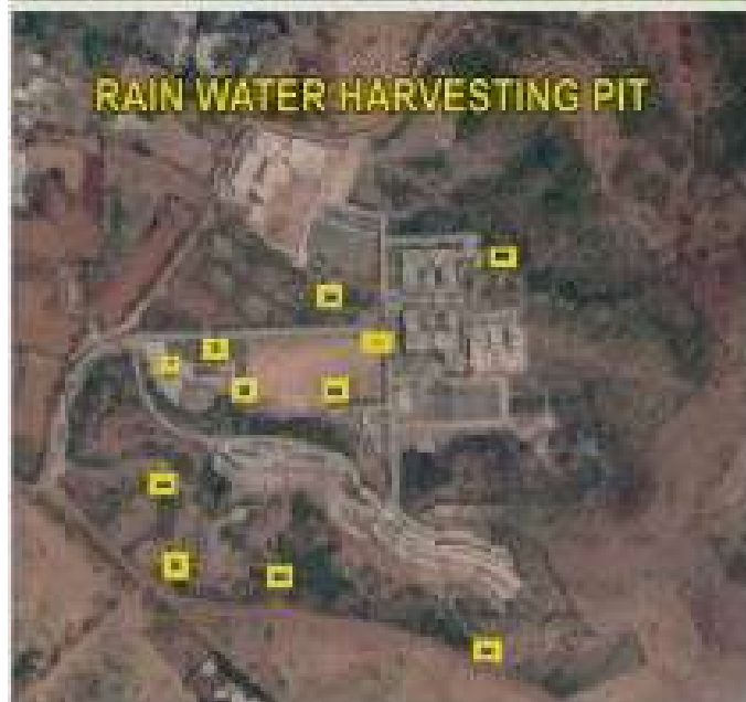
RAIN WATER HARVESTING PIT

खैरत ने कहा - एमिली टांजेंसू सा सील त्त सभै विभाग... (The rest of the text in this block is partially obscured or cut off in the image)