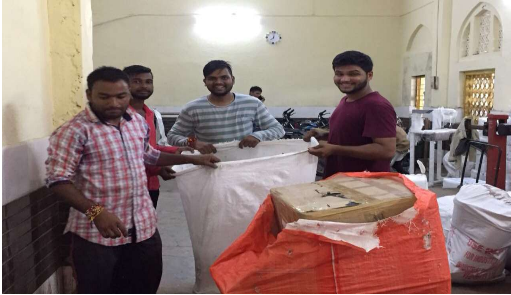
Students are helping to railway employees to load these boxes on the train