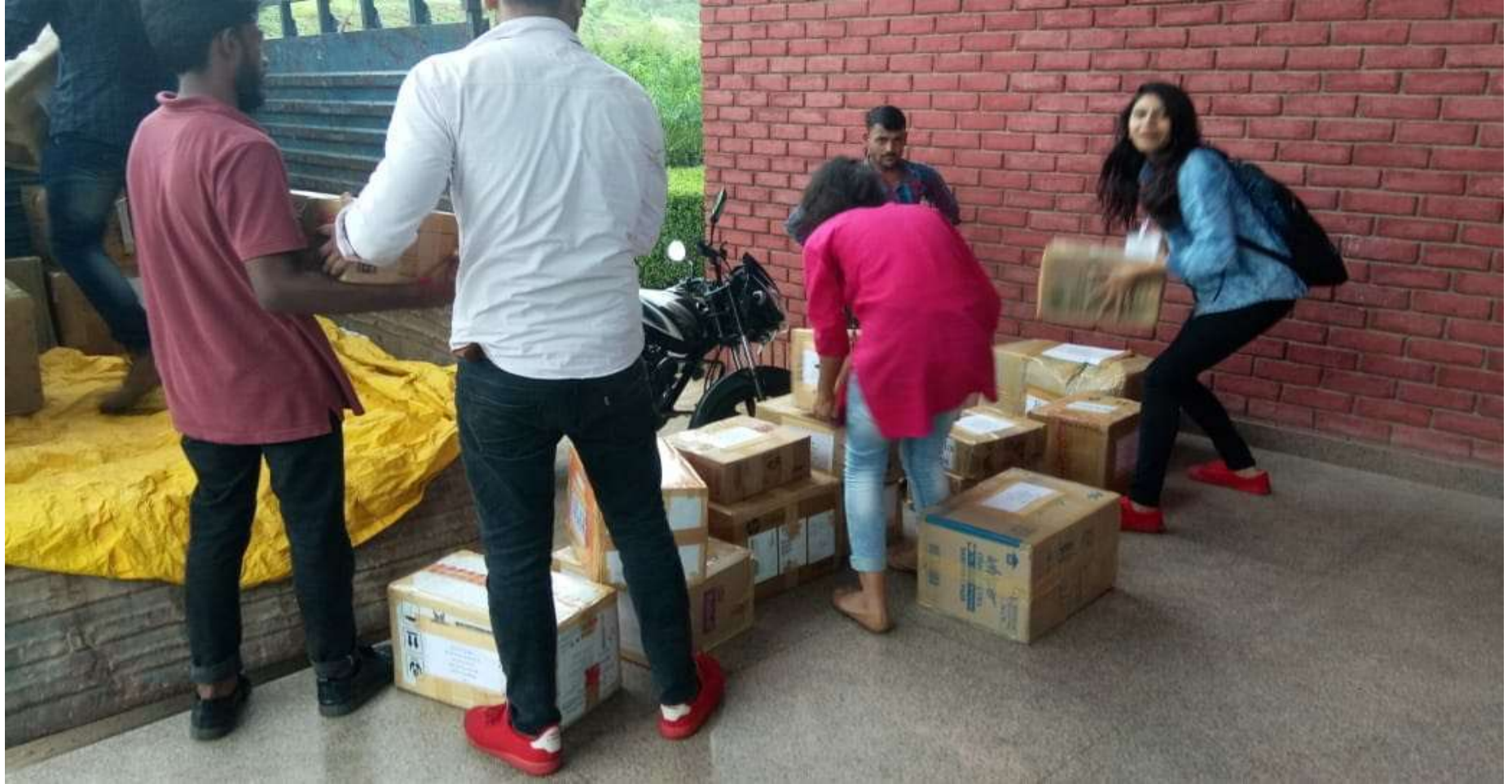
Students are loading the boxes in the truck