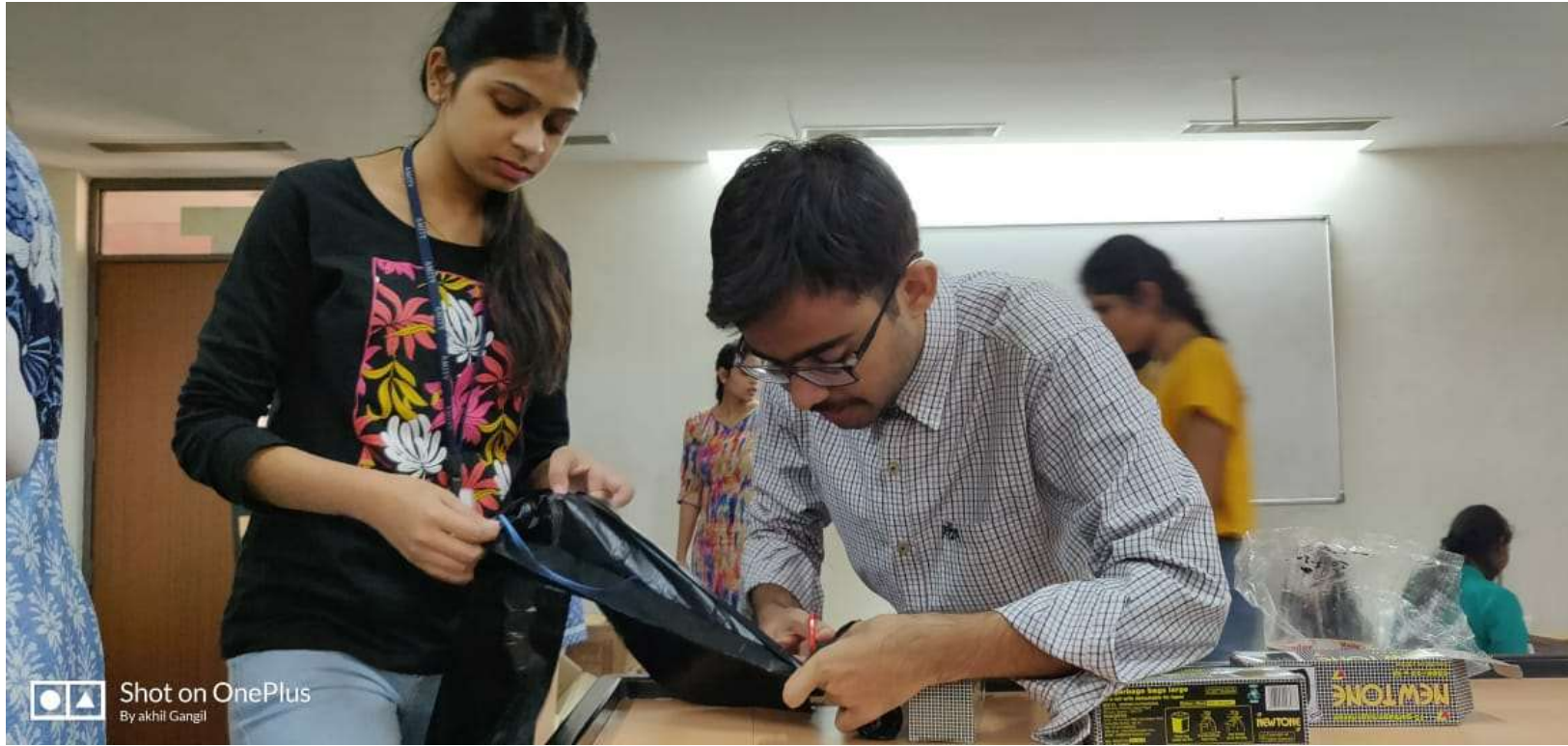
Students are packing the collected items