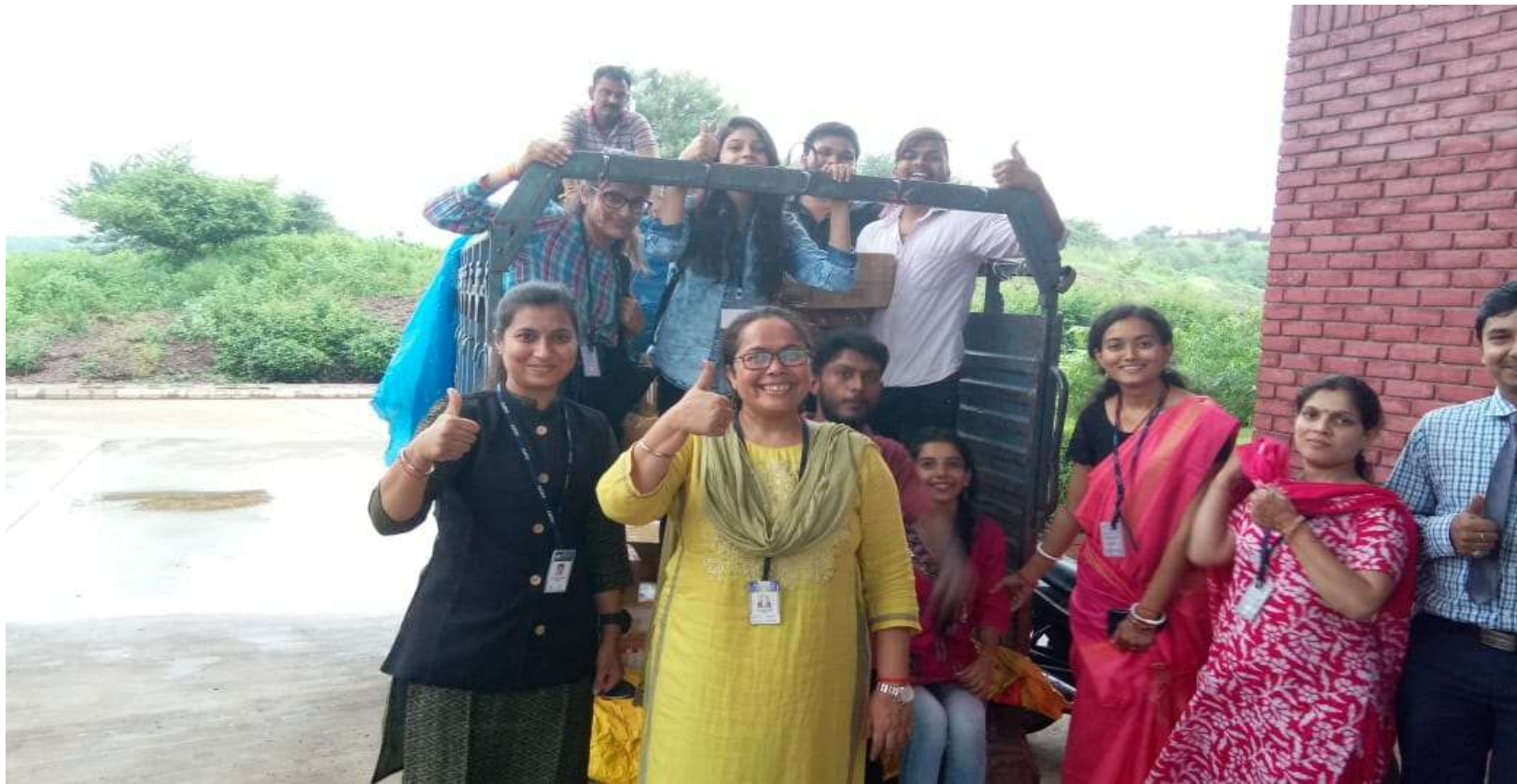
Truck is ready to move to railway station