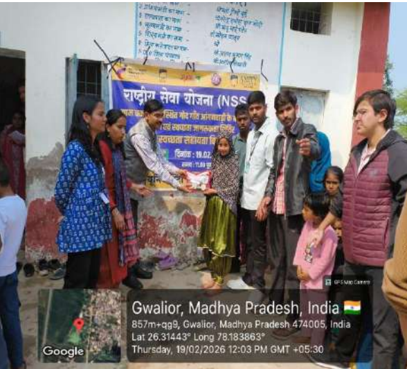
Gwalior, Madhya Pradesh, India 🇮🇳 857m+qg9, Gwalior, Madhya Pradesh 474005, India Lat 26.31443° Long 78.183863° Thursday, 19/02/2026 12:03 PM GMT +05:30