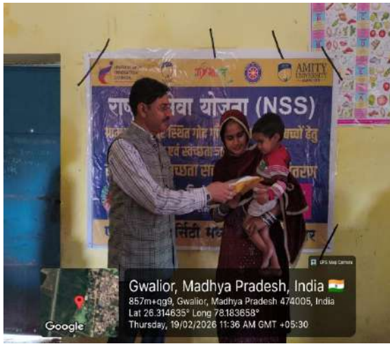
Gwalior, Madhya Pradesh, India 🇮🇳 857m+qg9, Gwalior, Madhya Pradesh 474005, India Lat 26.314635° Long 78.183658° Thursday, 19/02/2026 11:36 AM GMT +05:30