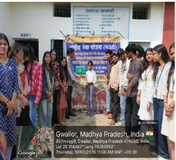
Gwalior, Madhya Pradesh, India 🇮🇳 857m+qg9, Gwalior, Madhya Pradesh 474005, India Lat 26.314467° Long 78.183892° Thursday, 19/02/2026 11:58 AM GMT +05:30