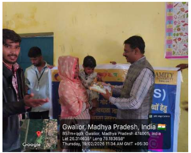
Gwalior, Madhya Pradesh, India 🇮🇳 857m+qg9, Gwalior, Madhya Pradesh 474005, India Lat 26.314635° Long 78.183658° Thursday, 19/02/2026 11:34 AM GMT +05:30