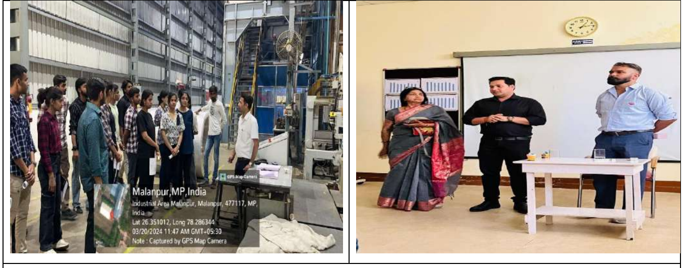
Visit to Supreme Foam Ltd. and Jamuna Auto Industry for Social activity project on 20.3.24