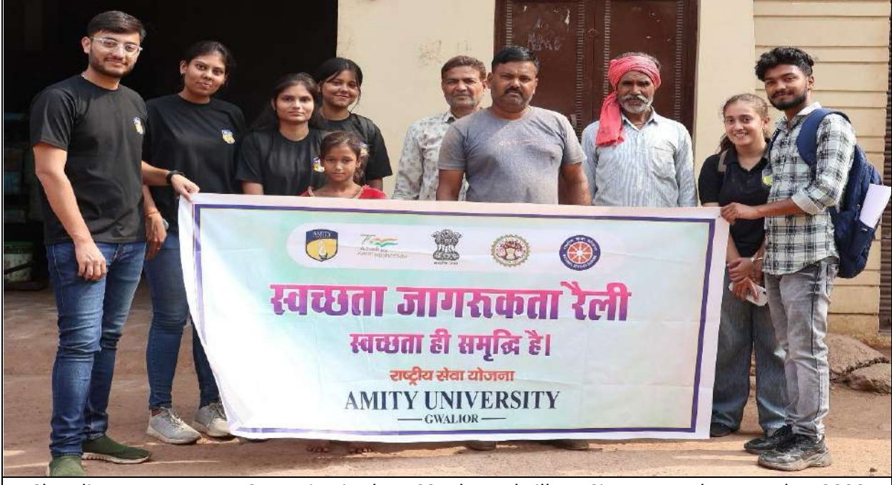
Cleanliness Awareness Campaign in the NSS adopted village Sigora on 4th November 2023