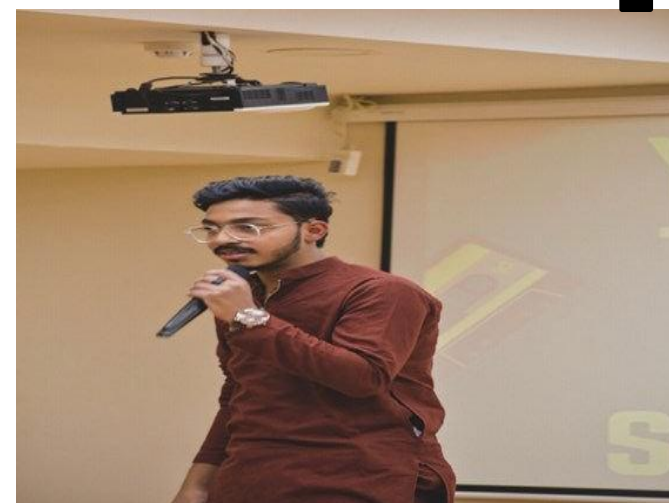
The perfect mix of poetry and rapping