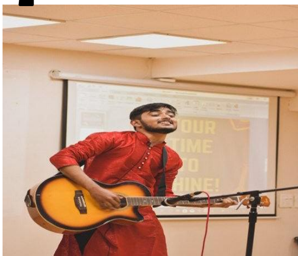
Soul full music played by student