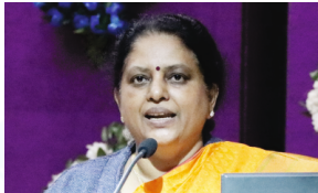
Dr. (Ms.) Tessy Thomas, Director General, Aeronautical Systems at DRDO interacting with the students of Amity University Gwalior