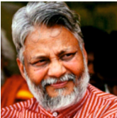
Dr. Rajendra Singh Waterman of India Indian environmentalist