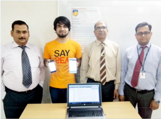
100 Dial app for State Government

Amity University Gwalior students thrive in a vibrant culture of innovation and new ideas.