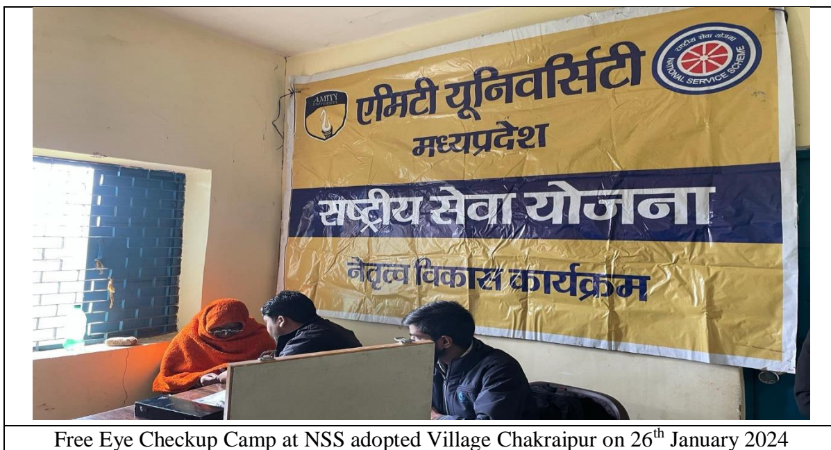
Free Eye Checkup Camp at NSS adopted Village Chakraipur on 26 th January 2024