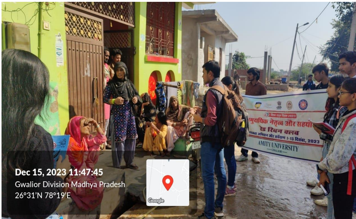
NSS Volunteers interacting with villagers of Chakraipur