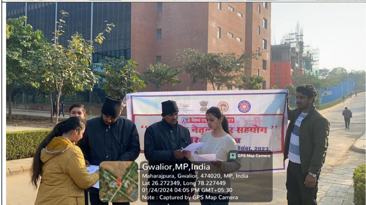
AUMP support staff and the volunteers from the Red Ribbon Club with participants