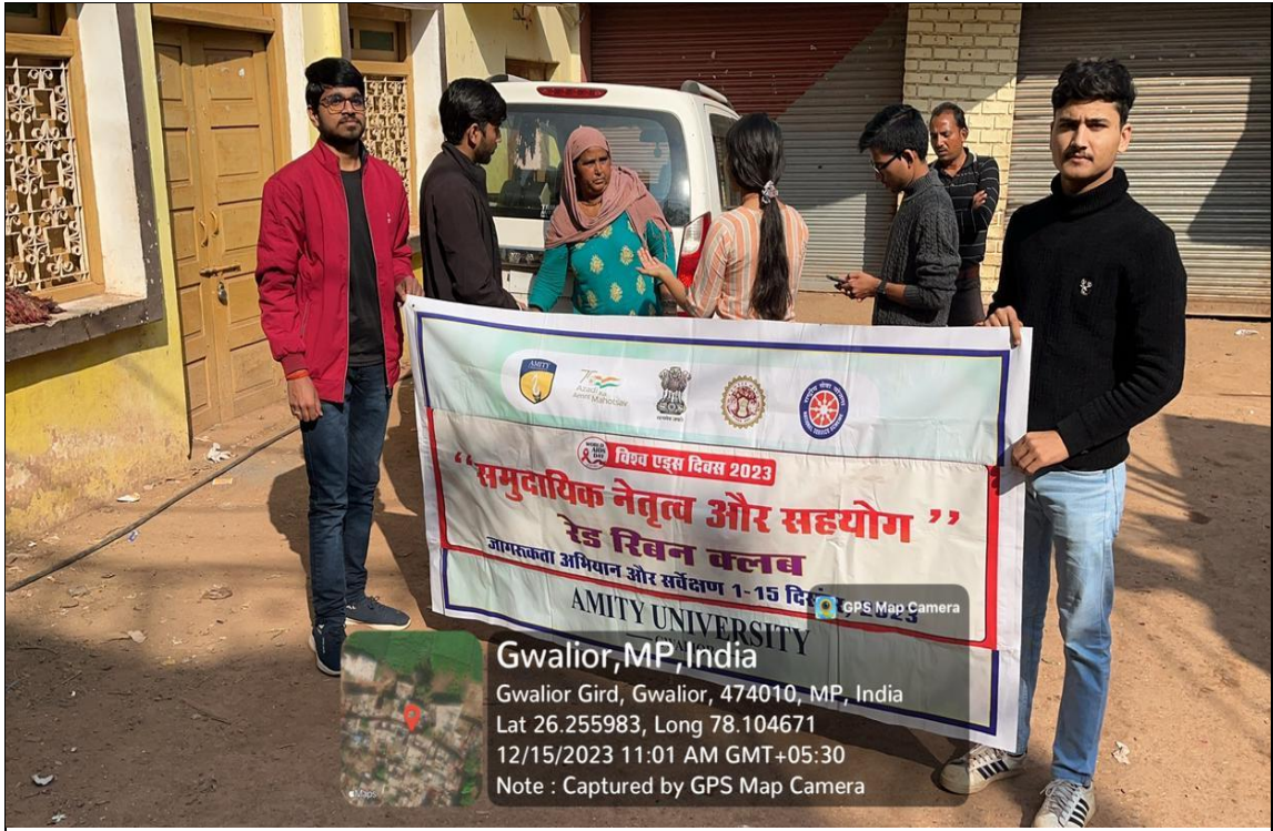
NSS volunteers with participants from village in the camp.