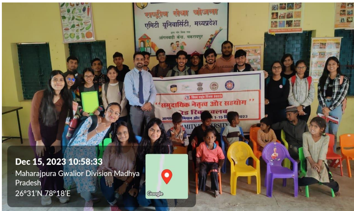
NSS Volunteers and Faculty Coordinator at Anganwadi Centre, Chakraipur

We conducted our outreach in the village's houses, interacting as much as we could with the locals. Incorporating interactive exercises like talks and quizzes helped to engage the villagers and strengthen their knowledge of HIV/AIDS. The camp was essential in debunking widely held beliefs and stigmas about the illness, creating a welcoming and encouraging atmosphere. The volunteers also explained the importance of personal hygiene to Chakraipur inhabitants and motivated them to maintain personal hygiene which will help to live a healthy life. Apart from the awareness campaigns, we also performed a study to find out how much the village as a whole knew about HIV/AIDS. With this all-encompassing strategy, we were able to evaluate the results of our work and pinpoint areas that needed further development. The trip to Chakraipur was very beneficial since it not only helped spread awareness but also encouraged community involvement in tackling the problems caused by HIV/AIDS. We are steadfast in our resolve to deepen our involvement in the community and provide people with the tools they need to take charge of their health and the health of others. Few glimpse of Chakraipur Visit