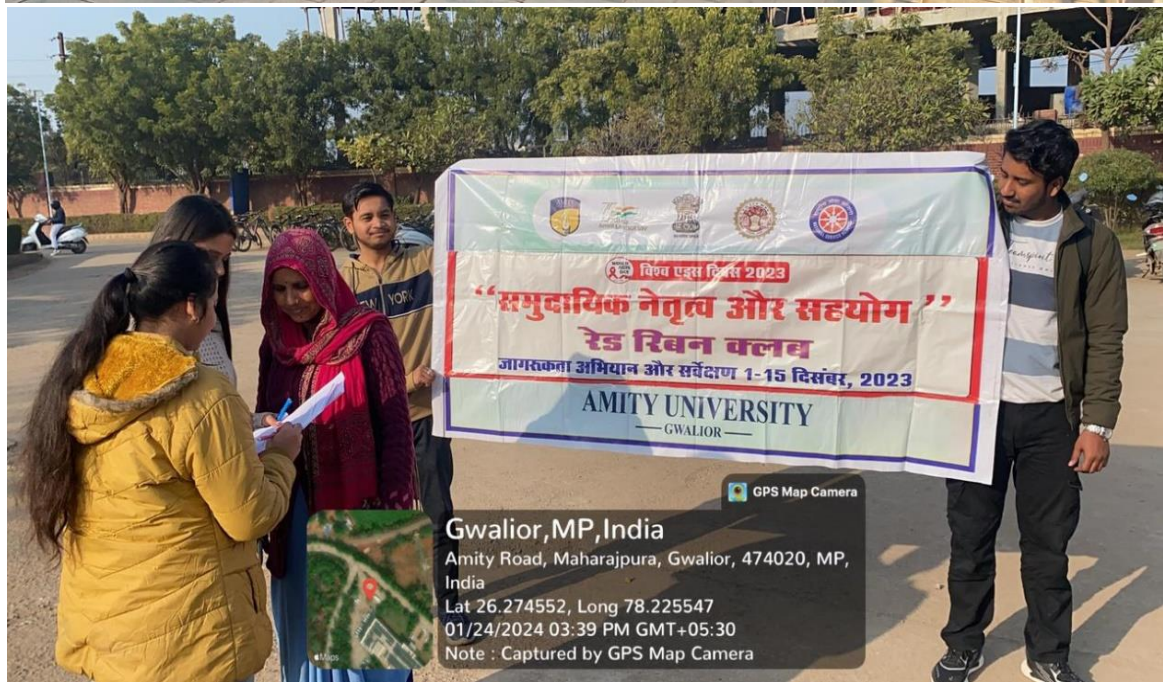
HIV AIDS Survey in the campus by the Red Ribbon Club Volunteers of AUMP