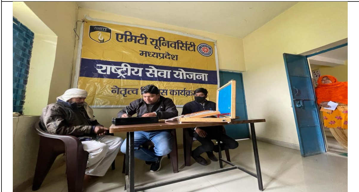
Free eye check up camp by NSS at adopted Village Chakraipur on 26 th January 2024