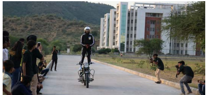
During the bike stunt