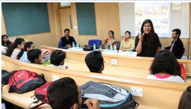
Students at the guest lecture

A Guest Lecture on 'Eligibility Criterion and Essential Qualities in Designers and Models for Successful Participation in the Fashion Event' was organised by Amity School of Fashion Technology. The organis-