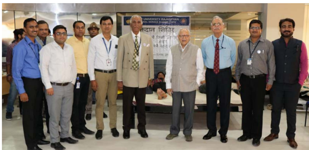
Visit of dignitaries at Blood Donation Camp