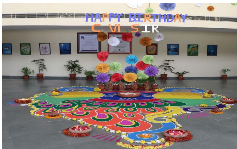
Rangoli displayed for the occasion

The following events were conducted in Amity Law School: A Poster Competition on Law from the eyes of Infant. Through this event the students got an opportunity to express their views and understanding they developed after entering this new world; THE LEGAL WORLD a Nukkad Natak on child rights, was conducted in which 13 participants performed enthusiastically on child rights in which they covered many areas such as child marriage, right to education etc. Amity School of Microbial Technology (AIMT) presented inno-