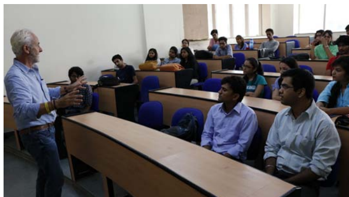
Lecture on recent trends in drug design