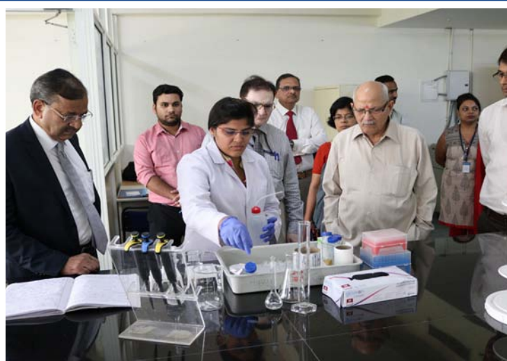
Vice-Chancellor at the chemistry lab

The exhibition and short film screening were inaugurated by Hon'ble Vice-Chancellor Prof S.K Dube. There were more than 100 entries for the photography and 8 entries short films. Prof. Dube congratulated the efforts of students to make the event