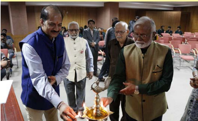
Inauguration of the event