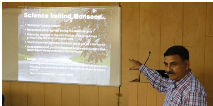
Science behind Monsoon