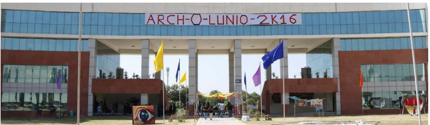
Amity School of Architecture and Planning during the event