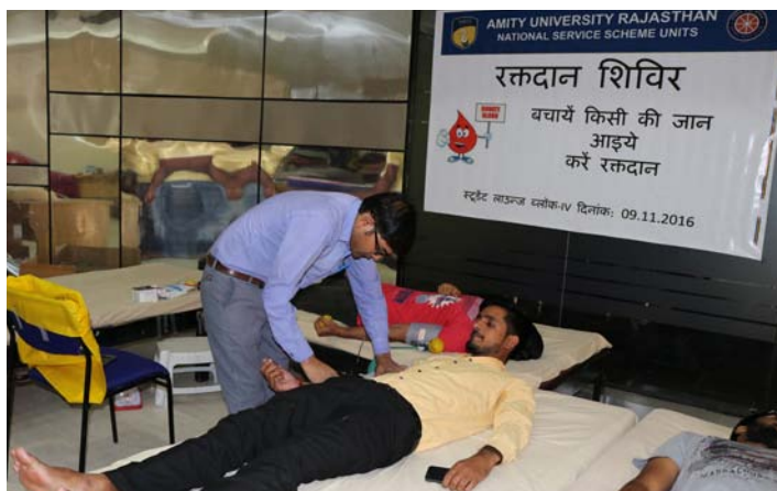
Student volunteer participating in the blood donation camp