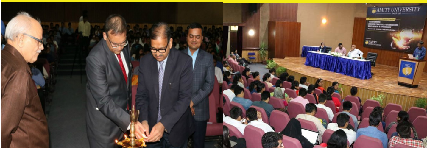
Lighting of the lamp and the inaugural session