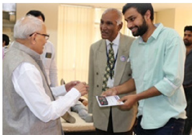
Honourable Vice-Chancellor presenting certificates to the blood donors