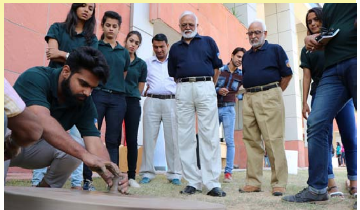
Creative work demonstration