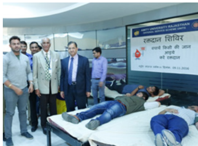
Visit of Pro Vice-Chancellor at Blood Donation Camp