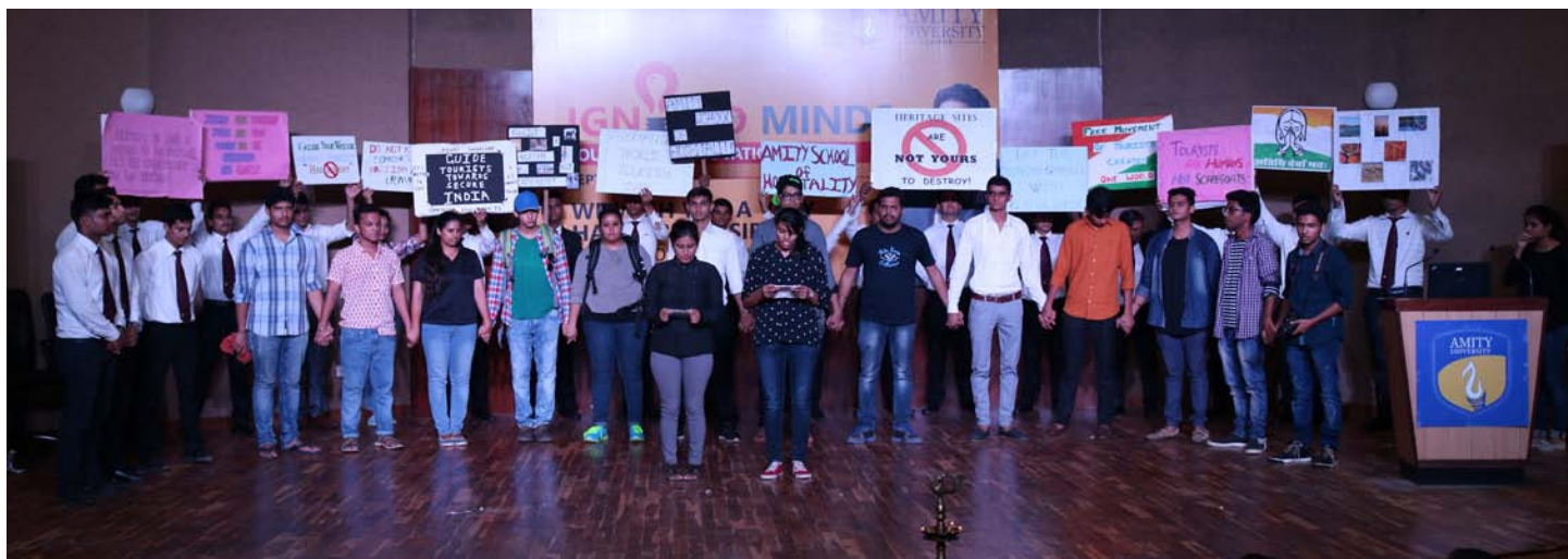
Cultural event by students on the occasion at the main auditorium