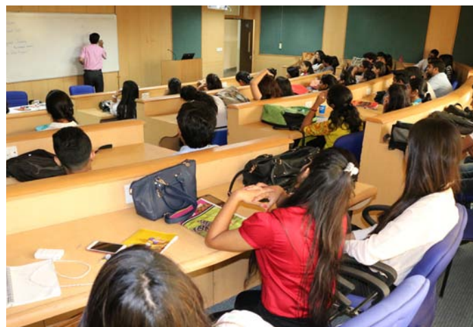
Students at the lecture