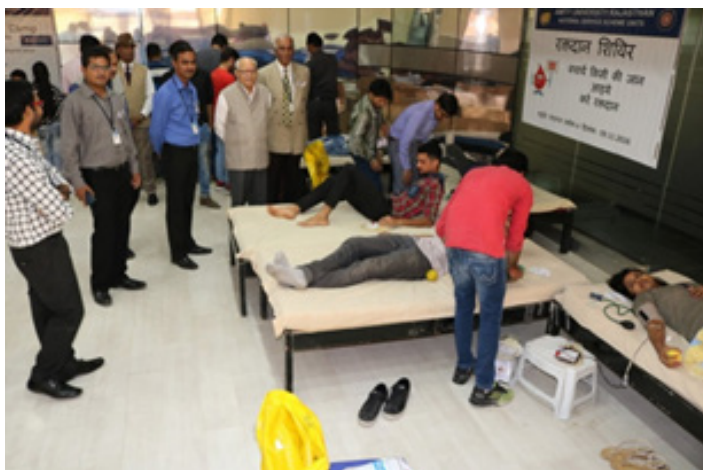
Honourable Vice-Chancellor encouraging the blood donors