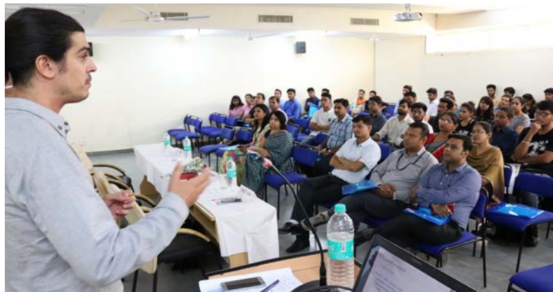
Soft computing explained