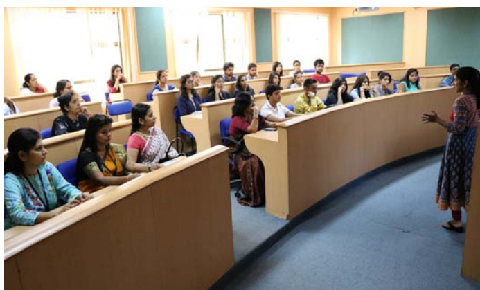
Teaching foreign languages