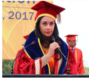
Ms. Diya Kumari - Presently Deputy Chief Minister in Govt. of Rajasthan, delivering acceptance speech for the Doctor of Philosophy (D.Phil.) - Honoris Causa