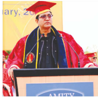
Mr. Prasoon Joshi, the noted Indian lyricist & screenwriter delivering a keynote address at Amity University Jaipur