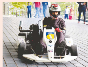
Amity F-1 Car

Amity University Rajasthan students are blazing new paths of success in various cutting-edge areas of science and technology. Some of their innovations include F-1 Car, Drone, Humanoid, All-Terrain Vehicle, Electric Bamboo Bicycle, Smart Shoes & Discounted Diagnostic Kits.