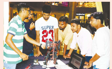
Student Innovative Project - Humanoid