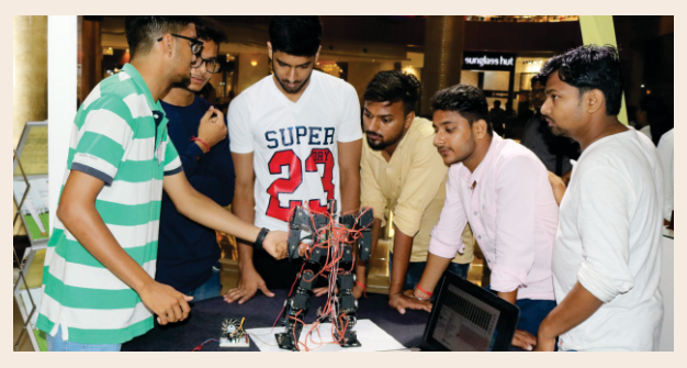
Student Innovative Project - Humanoid

Amity University Rajasthan, Jaipur has established interdisciplinary practices, research and outreach centers. These hubs of future-focused innovation are driven by Amity's faculty & scientists, who are exploring blazing new paths of success in various cutting-edge areas of science and technology. Some of the students' innovations include F-1 Car, Drone, Humanoid, All-Terrain Vehicle, Electric Bamboo Bicycle and Smart Shoes.