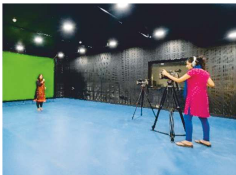
Hi-tech Labs & Learning Studios