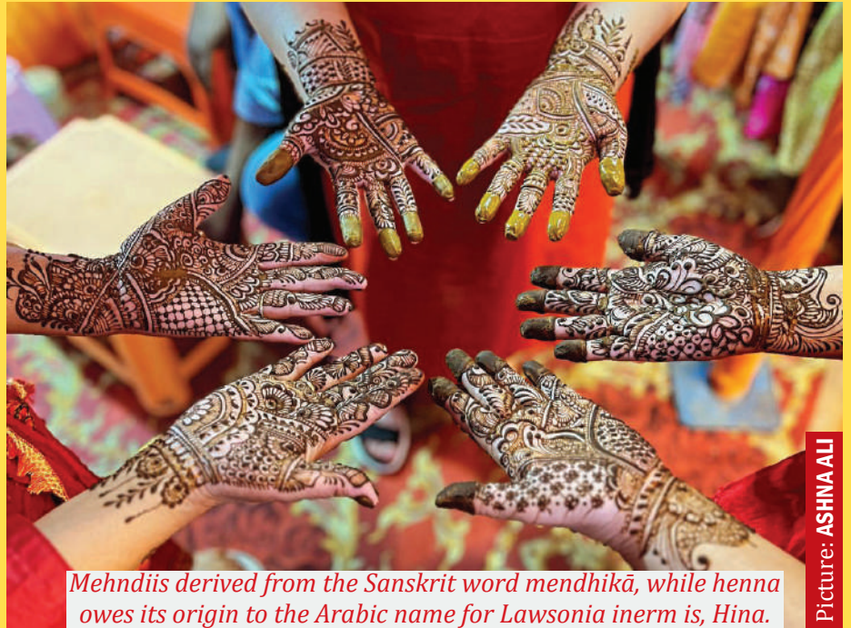
Mehndis derived from the Sanskrit word mendhikā, while henna owes its origin to the Arabic name for Lawsonia inermis, Hina.

Mehndi offers natural benefits beyond its decorative use. It possesses cooling properties, soothes the skin, and promotes hair health. Known for its anti-inflammatory