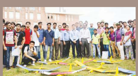
RC Plane Aeromodelling - Flight 2K17

Aligned with the overall culture of innovation and research at Amity University and bolstered by the progressive scientific outlook of the State Government, Amity University has established interdisciplinary practices, research & outreach centres. These hubs of future-focused innovation are driven by Amity's brilliant faculty and scientists, who are exploring blazing new paths of success in various cutting edge areas of science and technology.