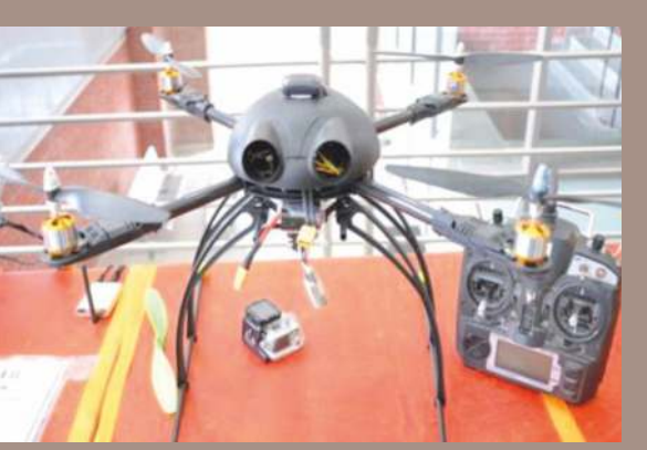
Student Innovative Project - Quad-Copte