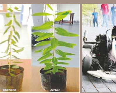
ano water' technology