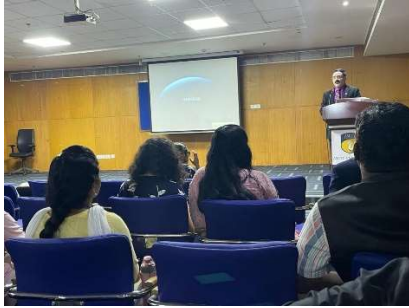
Event: Stress Management Seminar