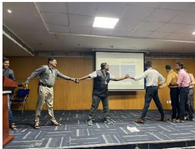
Event: Wellbeing Screening