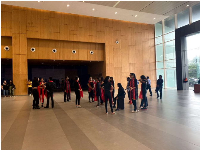
Event: Happiness Wall