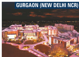
GURGAON (NEW DELHI NCR)