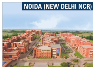
NOIDA (NEW DELHI NCR)