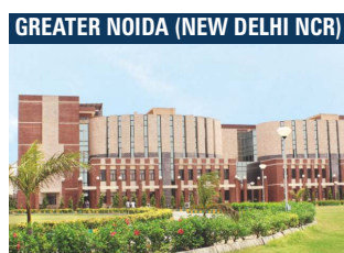
GREATER NOIDA (NEW DELHI NCR)