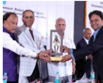
The National Conference on Novel Strategies for Mitigating Biotic and Abiotic Stresses