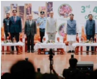
Amity University Chhattisgarh partnered with Vibgyor NE Foundation, NIT Raipur, and the Ministry of Forest, Chhattisgarh, to host Green Summit. The event was graced by Hon'ble Governor of Chhattisgarh, Shri Ramen Deka, Hon'ble Chief Minister of Chhattisgarh, Shri Vishnu Deo Sai, Hon'ble Minister for Forest and Climate Change, Shri Kedar Kashyap.

Be part of a university renowned for extensive industry interaction. At Amity University Chhattisgarh students interact with several CEOs & Global Gurus through unique modules such as CEO Dinner Series, CEO's Forum etc., wherein industry leaders, top professionals, entrepreneurs, policy makers and global gurus share their wisdom, insights and experiences, thereby facilitating practical learning for you.